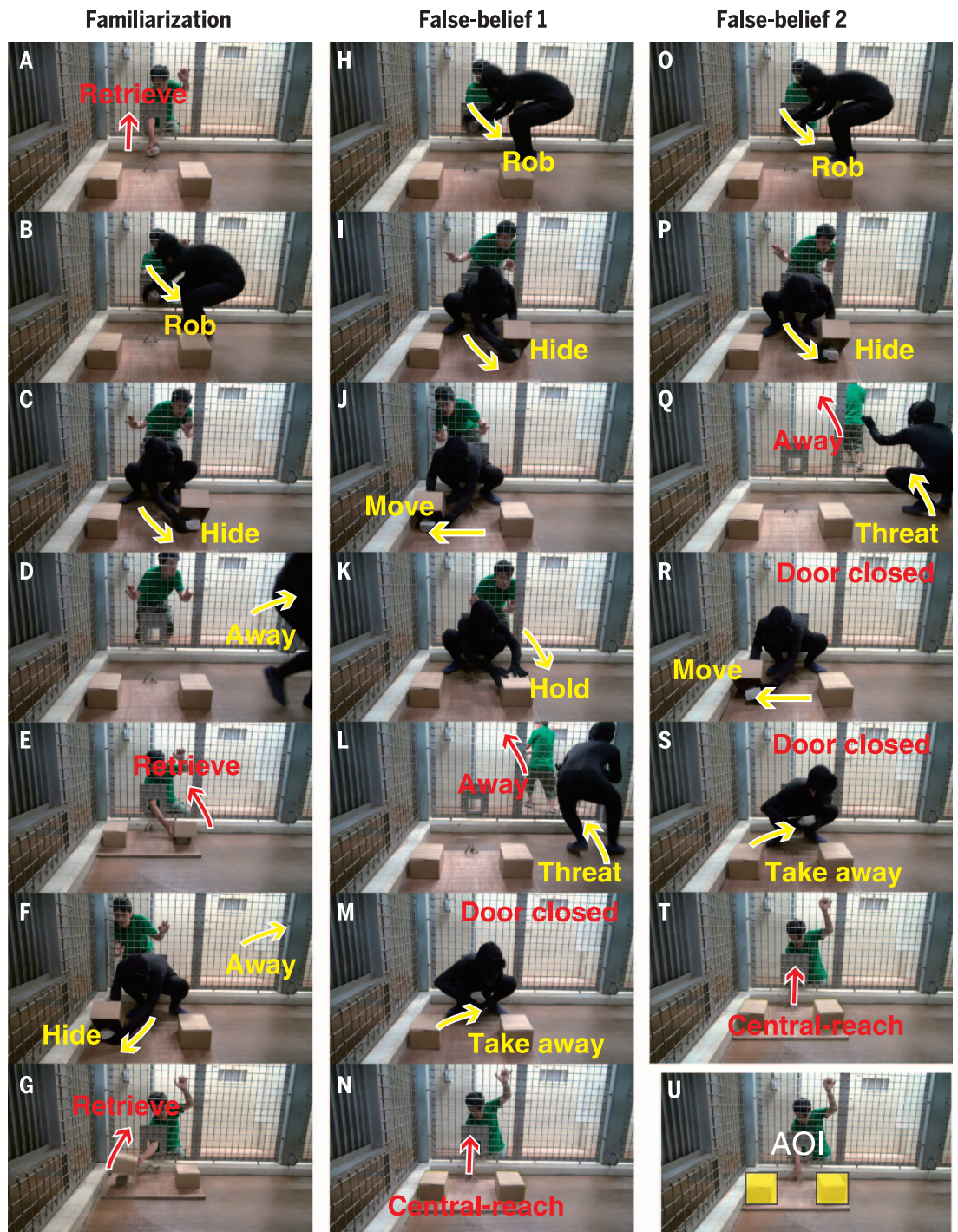
Fig. 2. Events shown in experiment two. (A to G) Familiarization. (H to M) Belief induction for the FB1 condition. (N to S) Belief induction for FB2. (T) Central reach for FB1. (U) AOI defined for the target and distractor boxes. Following the infant study (10), we included an additional action in FB1 [KK touched the distractor box (K)] to control for subjects looking to the last place that the actor attended. See movie S2.

(FB1) or absent (FB2). In both conditions, the object was then completely removed before the agent returned to search for it. The actions presented during the induction phase controlled for several low-level cues—namely, that participants could not solve the task by simply expecting the agent to search in the first or last location where the object was hidden or the last location where the agent attended (10). Whether the object was hidden first in the left or right location during familiarization trials and whether the target of the agent's false belief was the left or right lo-