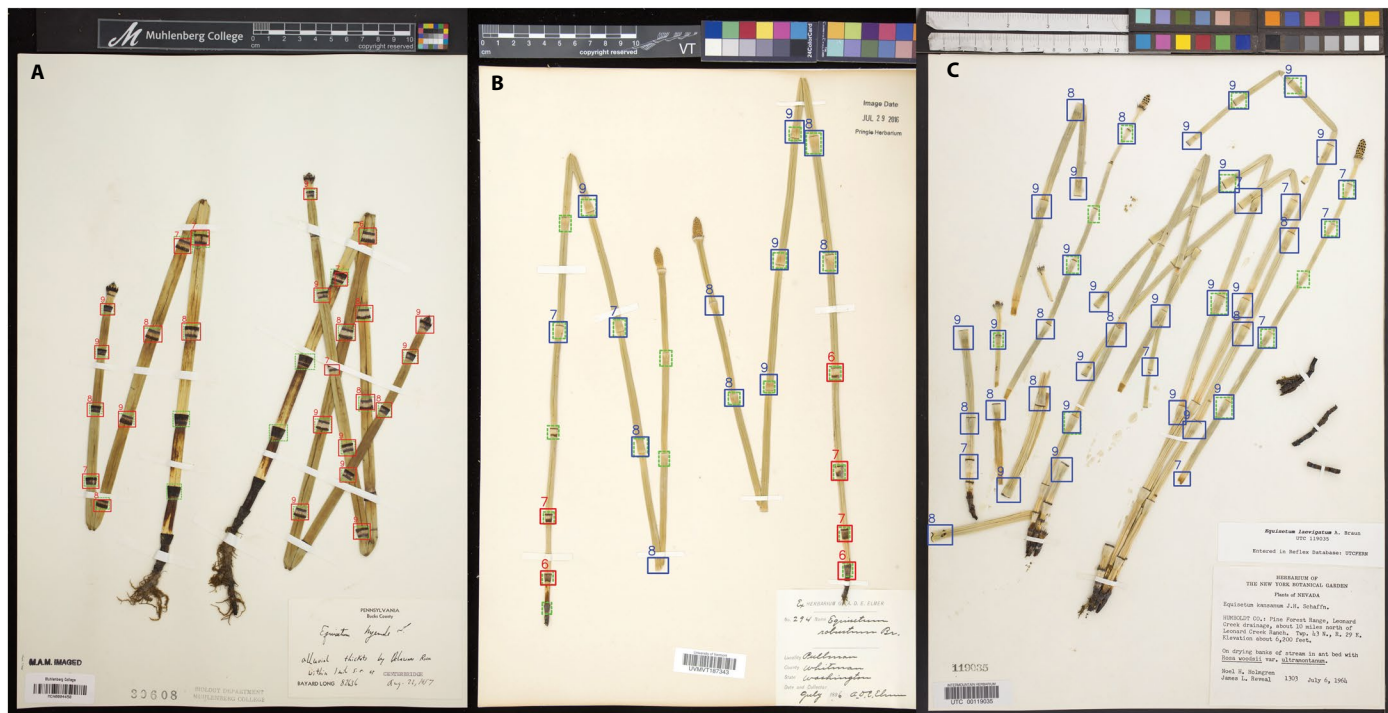
FIGURE 2. Examples of human versus machine-applied annotations on digitized images of Equisetum . (A) Equisetum hyemale ( http://serneportal.org/portal/collections/individual/index.php?occid=13382583 ). (B) Equisetum x ferrissii ( http://serneportal.org/portal/collections/individual/index.php?occid=11039870 ). (C) Equisetum laevigatum ( http://serneportal.org/portal/collections/individual/index.php?occid=207187 ). Green dashed boxes are human annotations. Solid boxes are detection results: a red box denotes a hyemale -type (H) node; a blue box denotes a laevigatum -type (L) node. (A) The detector missed four nodes and classified all the others correctly as being of the H variety, with high confidence scores of 6, or higher. (B) The detector missed five of the 21 nodes found by the human annotator and detected one spurious node (on the bottom kink of the stem on the left). It also found a node that had not been annotated (close to the strobilus on the stem on the right), but visual inspection shows that this is a genuine node that had not been flagged by the human annotator. Of the 18 nodes detected (genuine or spurious), the classifier determined six to be H nodes (red) and 12 to be L nodes (blue), all with high confidence scores (6, or higher). (C) Although the human annotator marked only 13 stem nodes, the classifier found many more, and classified all of them as L nodes, with high confidence scores (7, or higher). Visual inspection shows that these additional detections, which would be denoted as “false positives” in a standard evaluation (because they do not match human annotations), are all genuine nodes.

an image typically has many nodes but few strobili. The paucity of strobili in our preliminary data set made it impossible to train a detector, given the small number of annotated images we had at our disposal (Table 1). We hope to reintroduce strobili once we gain access to more annotations in future work. We describe detector, detection statistics, and classifier below.