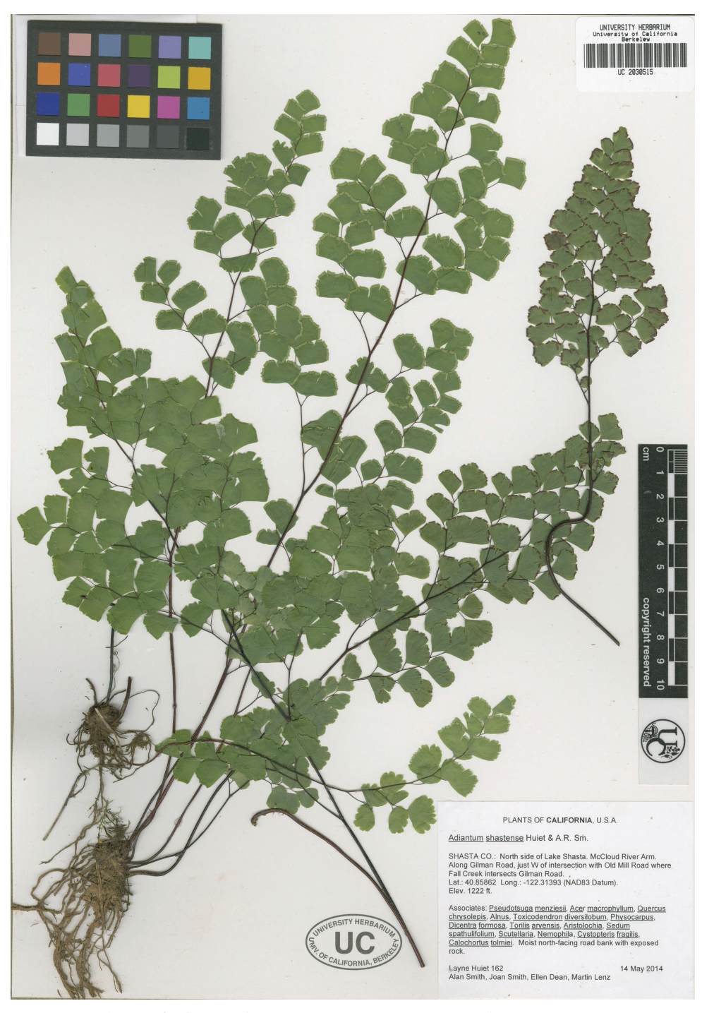
Figure 2. Holotype of Adiantum shastense Huiet & A.R.Sm. (Huiet et al. 162, UC)