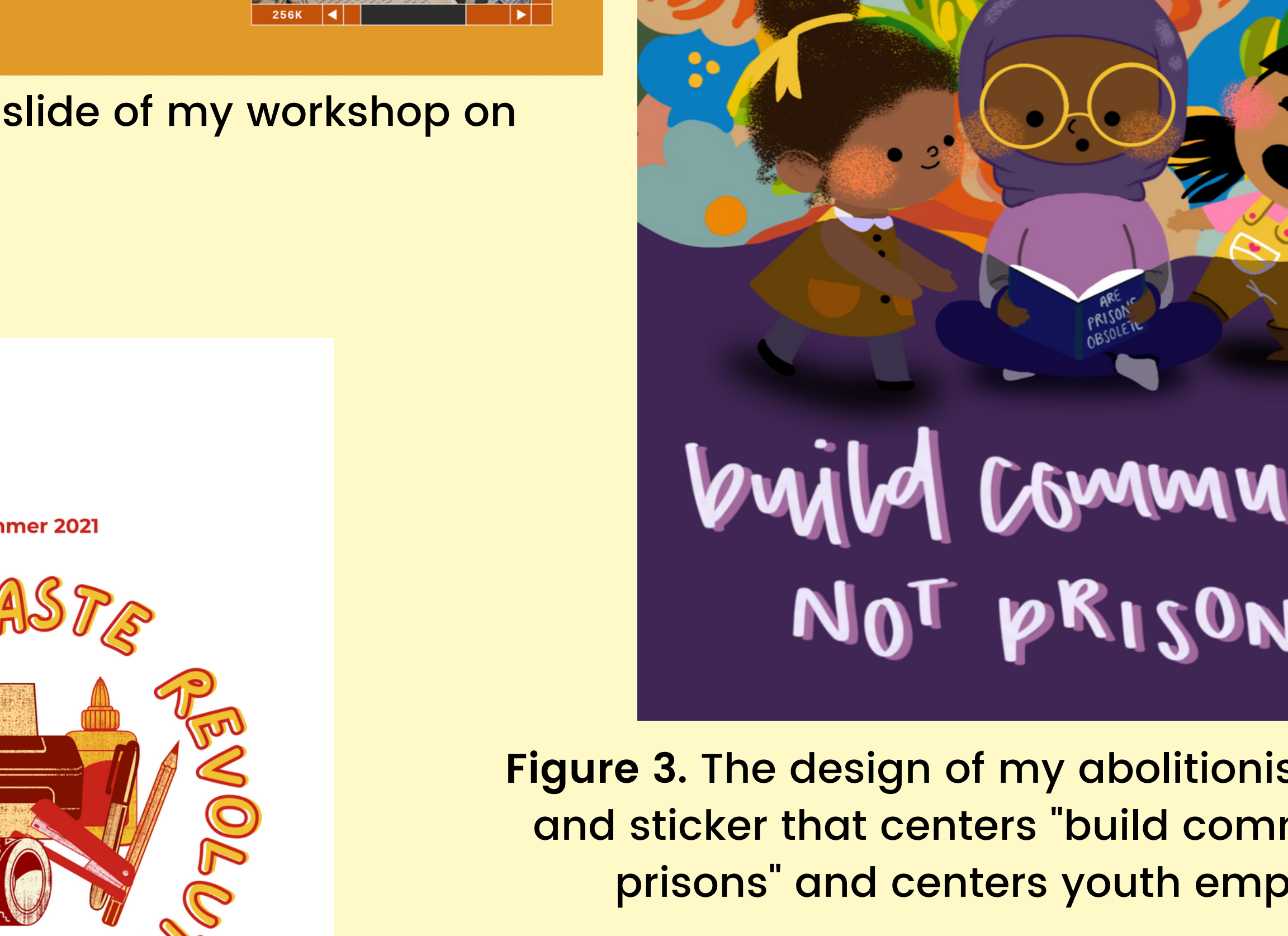
Figure 3. The design of my abolitionist postcard and sticker that centers "build community, not prisons" and centers youth empowerment.