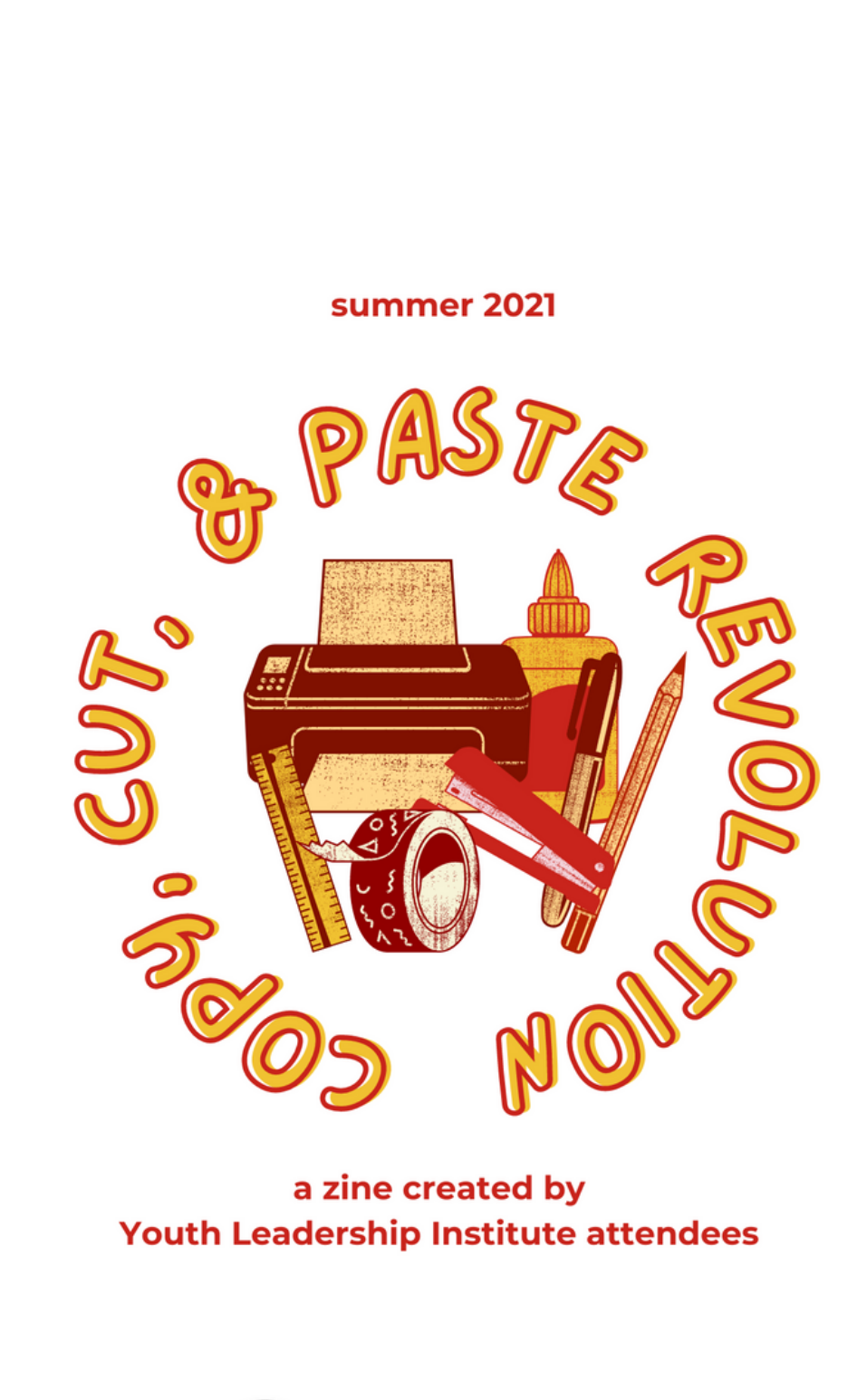
Figure 2. Cover page of the collective zine made as a part of my workshop on zine-making