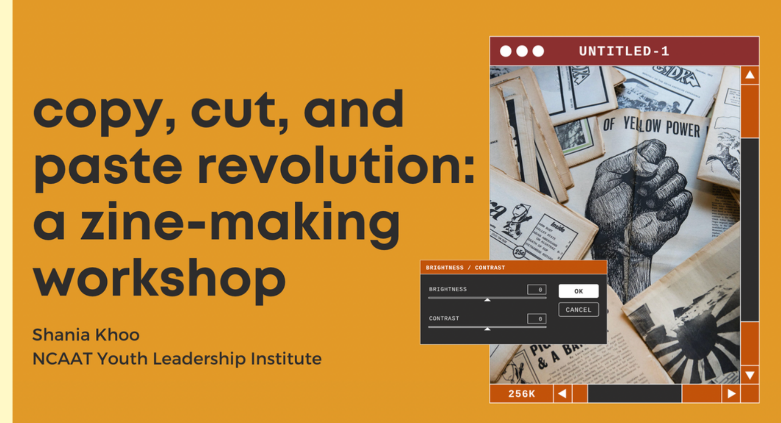
Figure 1. title slide of my workshop on zine-making