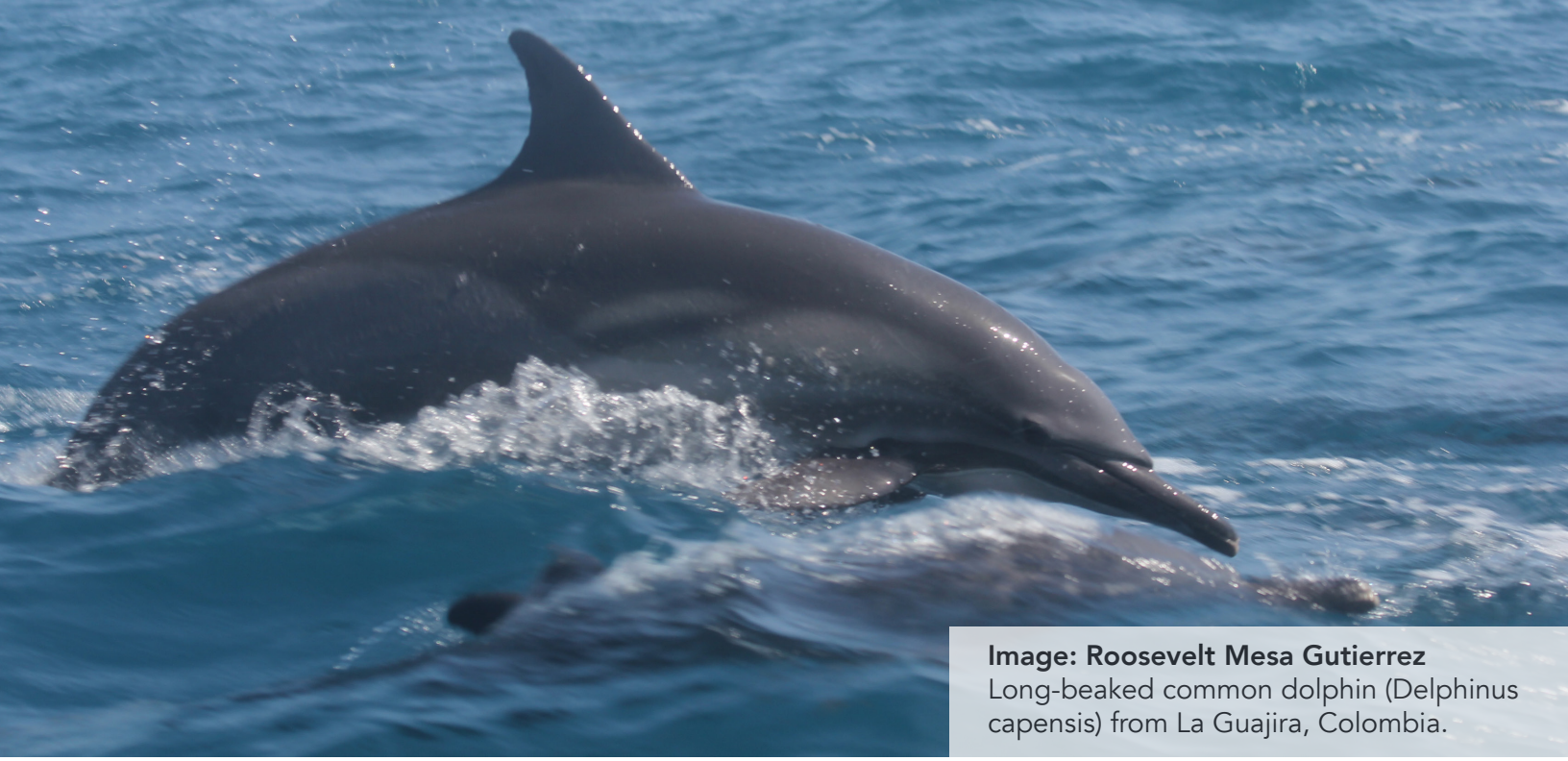
Image: Roosevelt Mesa Gutierrez Long-beaked common dolphin ( Delphinus capensis ) from La Guajira, Colombia.