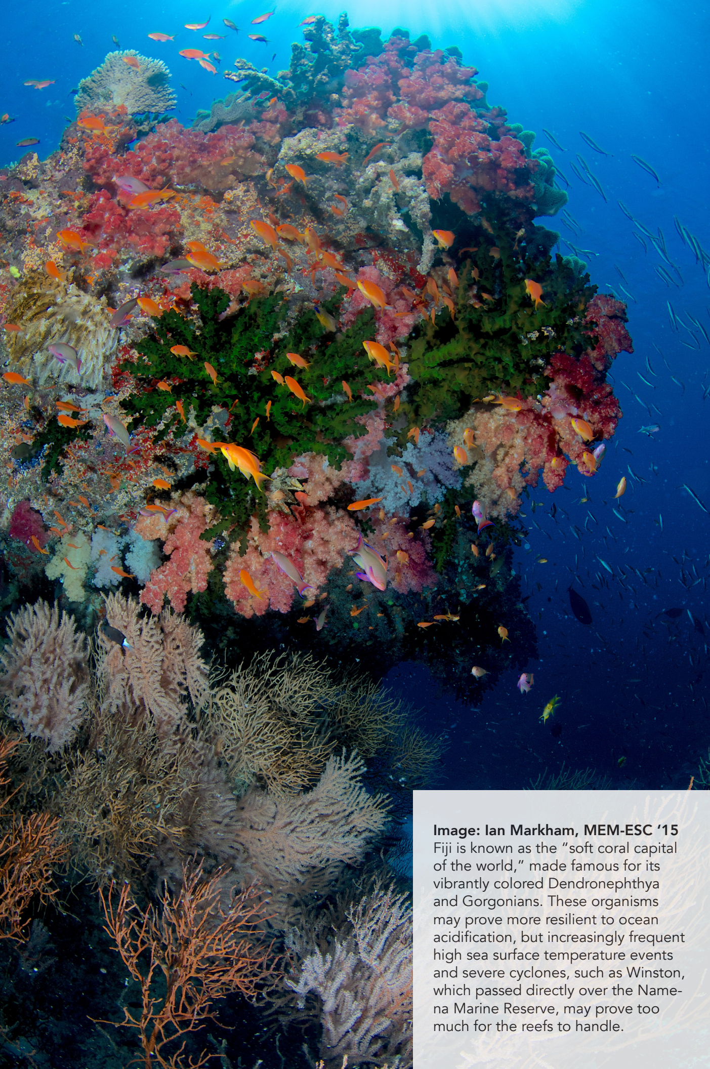
Fiji is known as the "soft coral capital of the world," made famous for its vibrantly colored Dendronephthya and Gorgonians. These organisms may prove more resilient to ocean acidification, but increasingly frequent high sea surface temperature events and severe cyclones, such as Winston, which passed directly over the Name-na Marine Reserve, may prove too much for the reefs to handle.