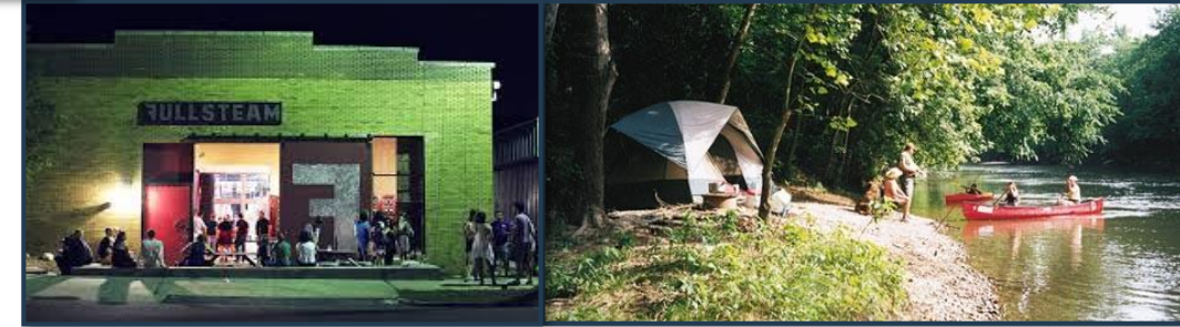
Fullsteam Brewery (left) Eno River State Park (right)