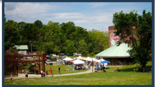
Durham Central Park (left) Marbles Museum in Raleigh (right)

With one of the nation's best education systems , the Triangle area is home to a number of top-notch preschools, Montessori schools, and both public and private schools. Duke Children's Campus offers full-time care for the young children of Duke employees, and they reserve a handful of spaces for children of graduate students.