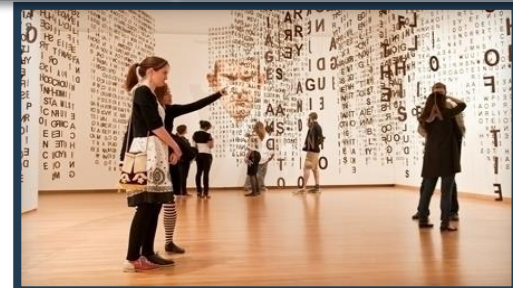
Nasher Museum (left) Streets and Southpoint (right)