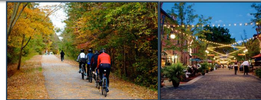
American Tobacco Trail (left) Brightleaf Square (right)

Aside from 5-time NCAA Champion Blue Devil Men’s Basketball... The Durham Bulls are a Triple-A minor league baseball team (the Tampa Bay Ray’s farm team) with a huge following. Tickets are cheap, beers are cheaper, and there’s not a bad seat in their beautiful stadium downtown at the historic American Tobacco Campus. We’re also still celebrating the Panthers trip to the Super Bowl, and the Carolina Hurricanes play right down the road in Raleigh!