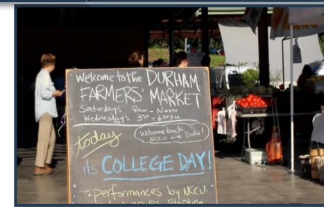
Durham Farmers’ Market

Want to get outside? Good news! Hiking, climbing, mountain biking, skiing, running, swimming, kayaking, fishing, camping, hunting, golfing, bird watching...you name it, we’ve got it! Need the beach? Durham is 2.5 hours from the nation’s best beaches. Craving mountain air? The Great Smoky Mountains are a quick 2 hours west.