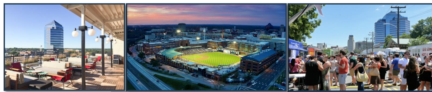
From Left to Right: Durham Rooftop Restaurant and Bar, Durham Bulls Athletic Park, Food Truck Rodeo

We are serious about our food here in the Bull City. Bon Appetit named Durham “ America’s Foodiest Small Town ” and Southern Living ranked us the South’s Tastiest Town (and they know the South!). Head to the year-round Farmers’ Market on Saturdays to pick up fresh veggies, local meats, fresh cut flowers, and hand-made crafts from local artisans. Make sure to grab breakfast at Scratch while you’re there!