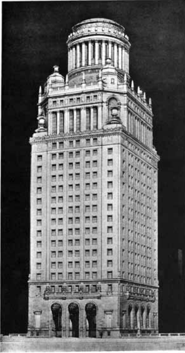
Plate Number 125