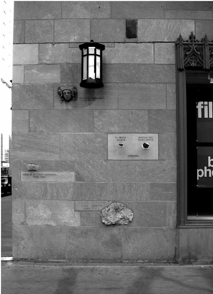
Fig. 9.4 Chicago Tribune Tower, section of the façade with fragments of the House (sic) of Parliament, the dome of St. Peter's Basilica in Rome, the pyramid at Giza (sic inscription in the process of correction) and two pieces from temples in Cambodia