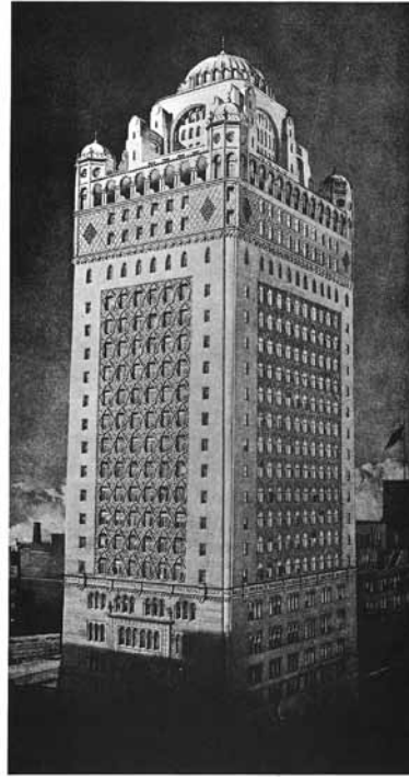
Plate Number 126