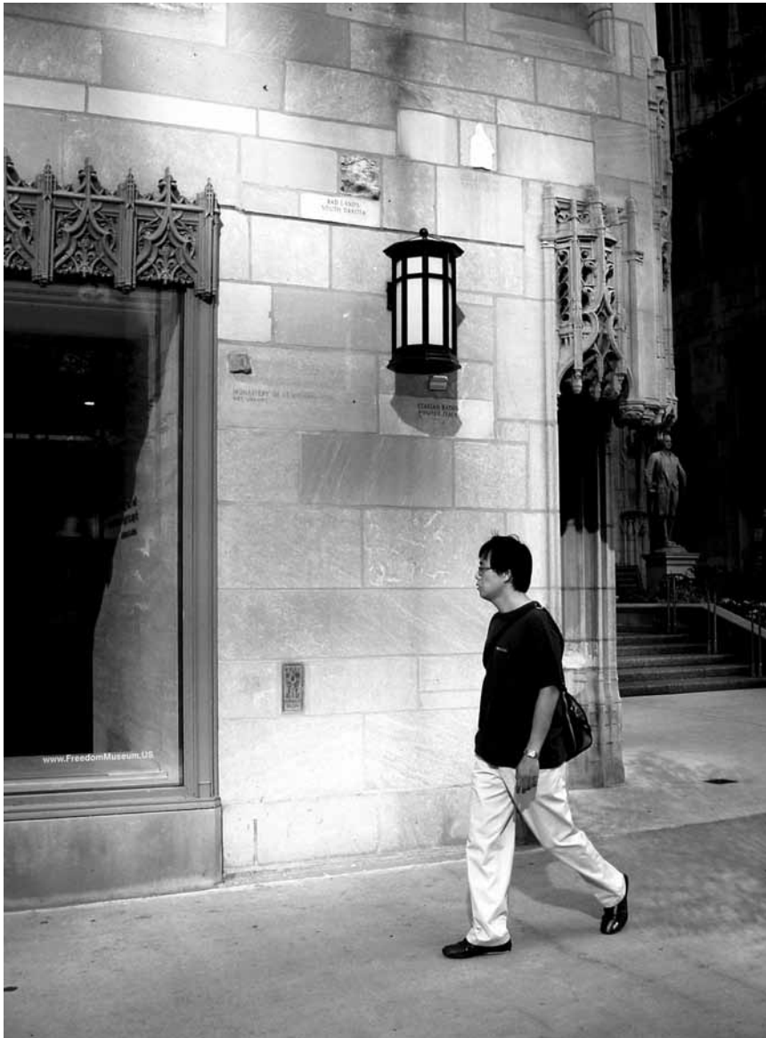
Fig. 9.3 Chicago, Tribune Tower, street view of the façade

and topographies, brought to Chicago from all fifty states and from many countries around the world, work? Certainly all of these chunks function indexically; that is, each scrap serves as a sign of the entirety of its originating locus. A small bit of stone, identified by its label as the Great Pyramid of Gaza ( sic! ), evokes a mighty structure. But the force of such evocations varies.