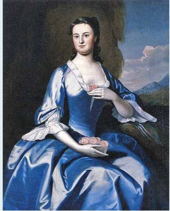
Left: Robert Feke, James Bowdoin II , 1748. Oil on canvas. Right: Robert Feke, Mrs. James Bowdoin II (Elizabeth Erving) , 1748. Oil on canvas.