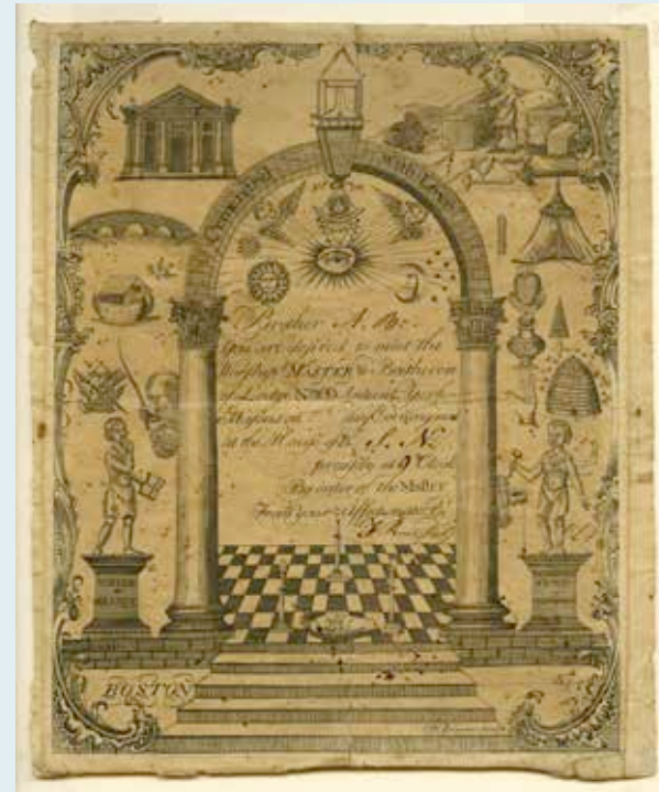
Left: John Singleton Copley, Portrait of Paul Revere , 1768. Oil on canvas. Right: Paul Revere, Mason Lodge 169 Notification , c. 1767. Engraving.