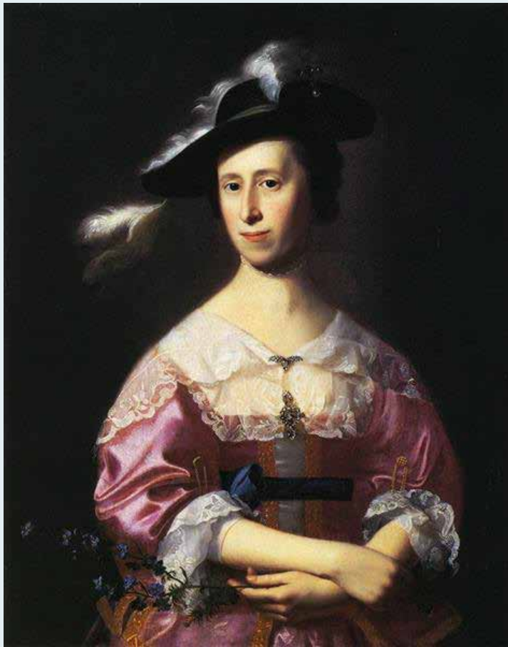
John Singleton Copley, Portrait of Mrs. Samuel Quincy (Hannah Hill) , c. 1761. Oil on canvas.