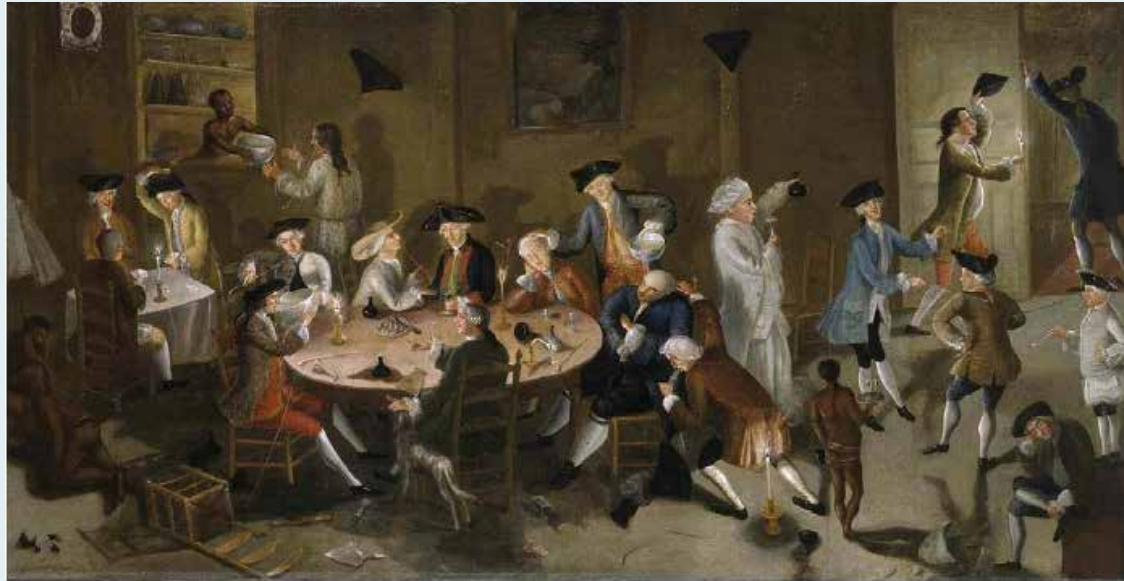
John Greenwood, Sea Captains Carousing in Surinam , c. 1758. Oil on bed ticking.