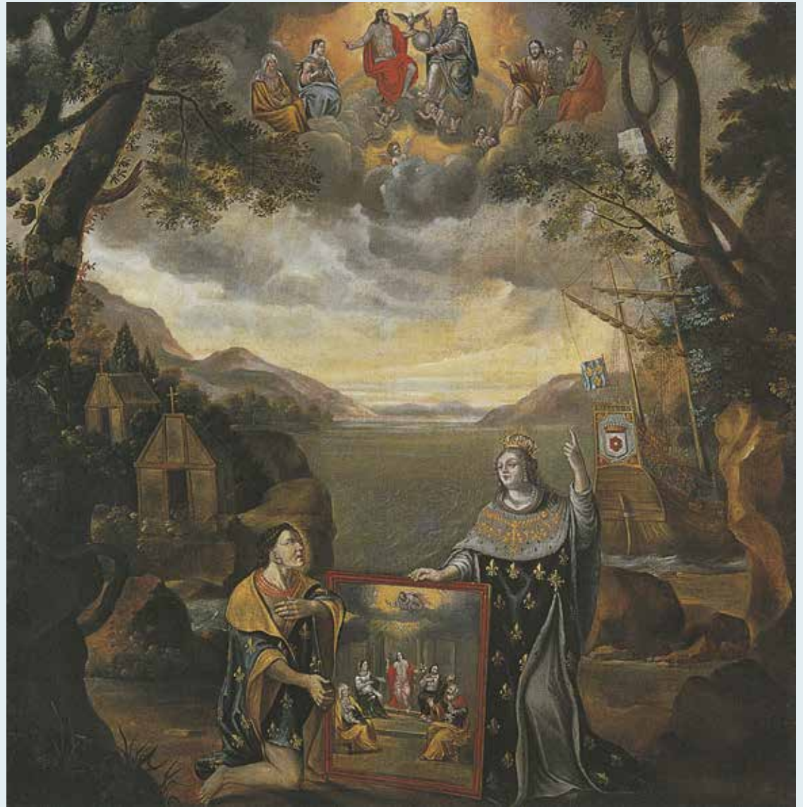
Attributed to Frère Luc (Claude François), France Bringing the Faith to the Indians of New France , c. 1675. Oil on canvas.