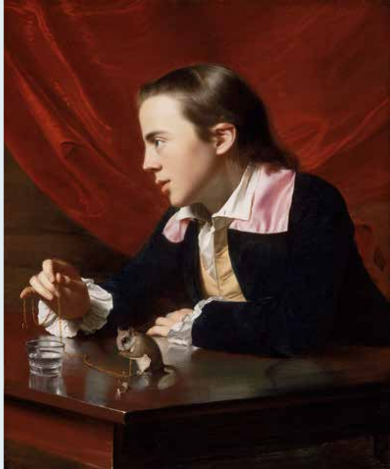
John Singleton Copley, Boy with a Squirrel (Henry Pelham), 1765. Oil on canvas.