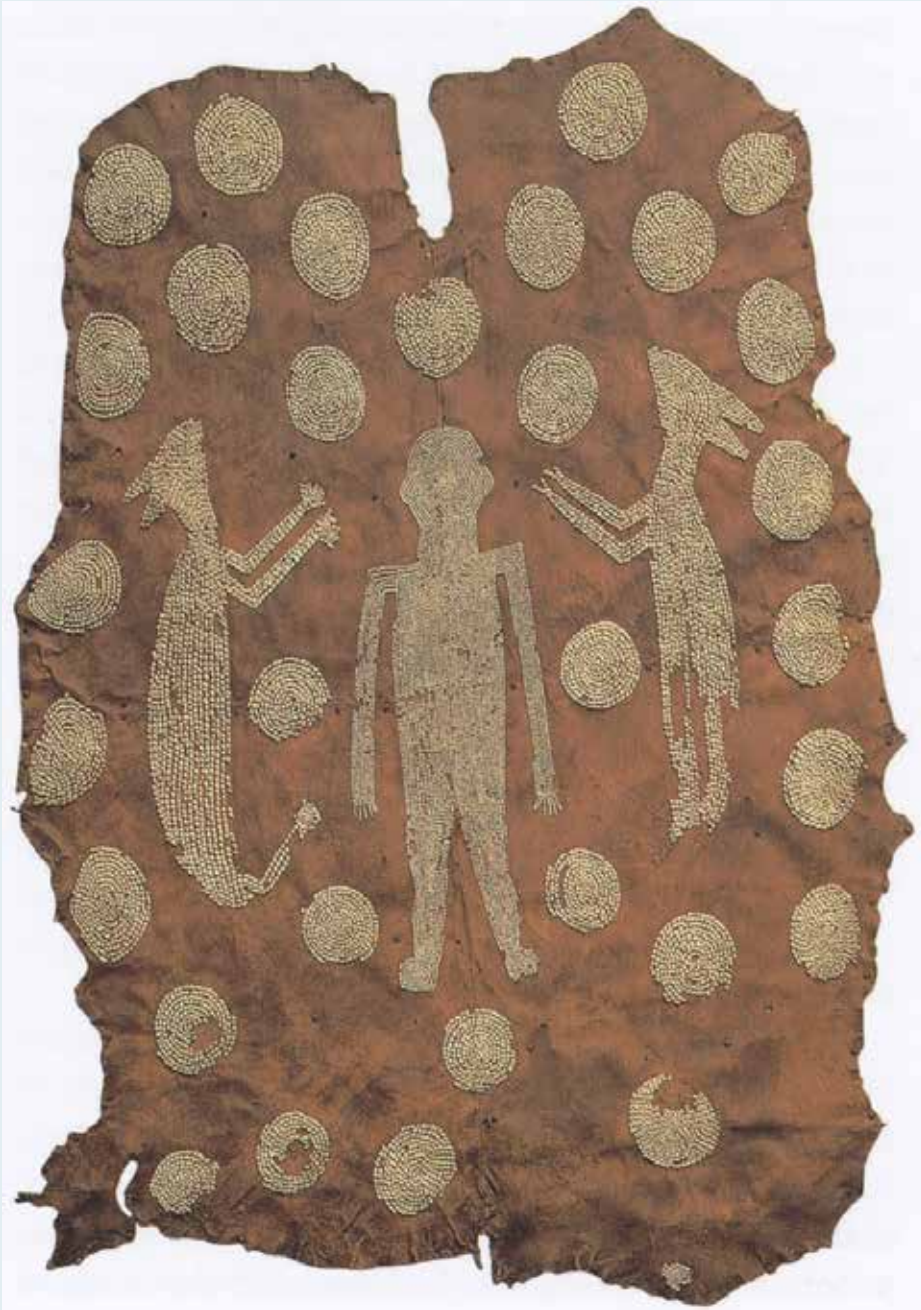
Anonymous (Powhatan culture), Mantle , before 1656. Hide embroidered with shells.