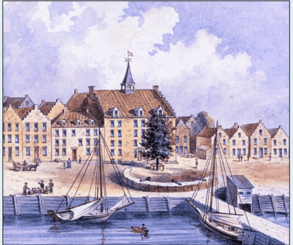
Left: Attributed to Henri Couturier, Governor Peter Stuyvesant , c. 1663. Oil on wood panel. Right: Stadt Huys (City Hall) , New Amsterdam, 1679.