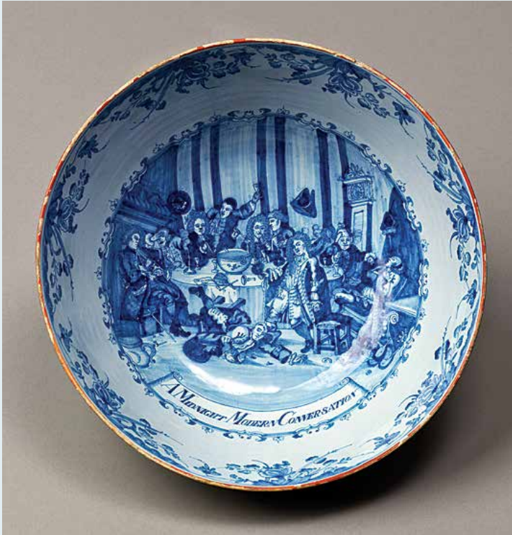
Punch bowl with William Hogarth's A Midnight Modern Conversation Scene, Liverpool, England, c. 1750. Tin-glazed earthenware.