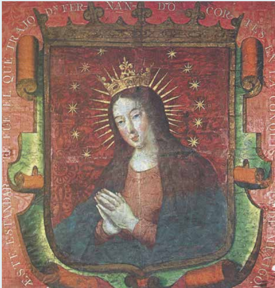
Anonymous (Spanish), Banner of Hernan Cortes , 16 th century. Oil on linen. Inscription: "This is that which brought Don Fernando Cortes to the conquest of Mexico."