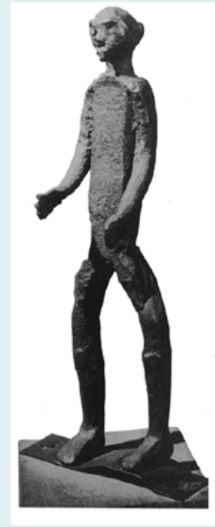
Left: Anonymous (European American), Boundary marker , Newbury, Massachusetts, 1636-50. Diorite. Right: Anonymous (African American), Figure , Alexandria, Virginia, late 18 th century. Wrought iron.