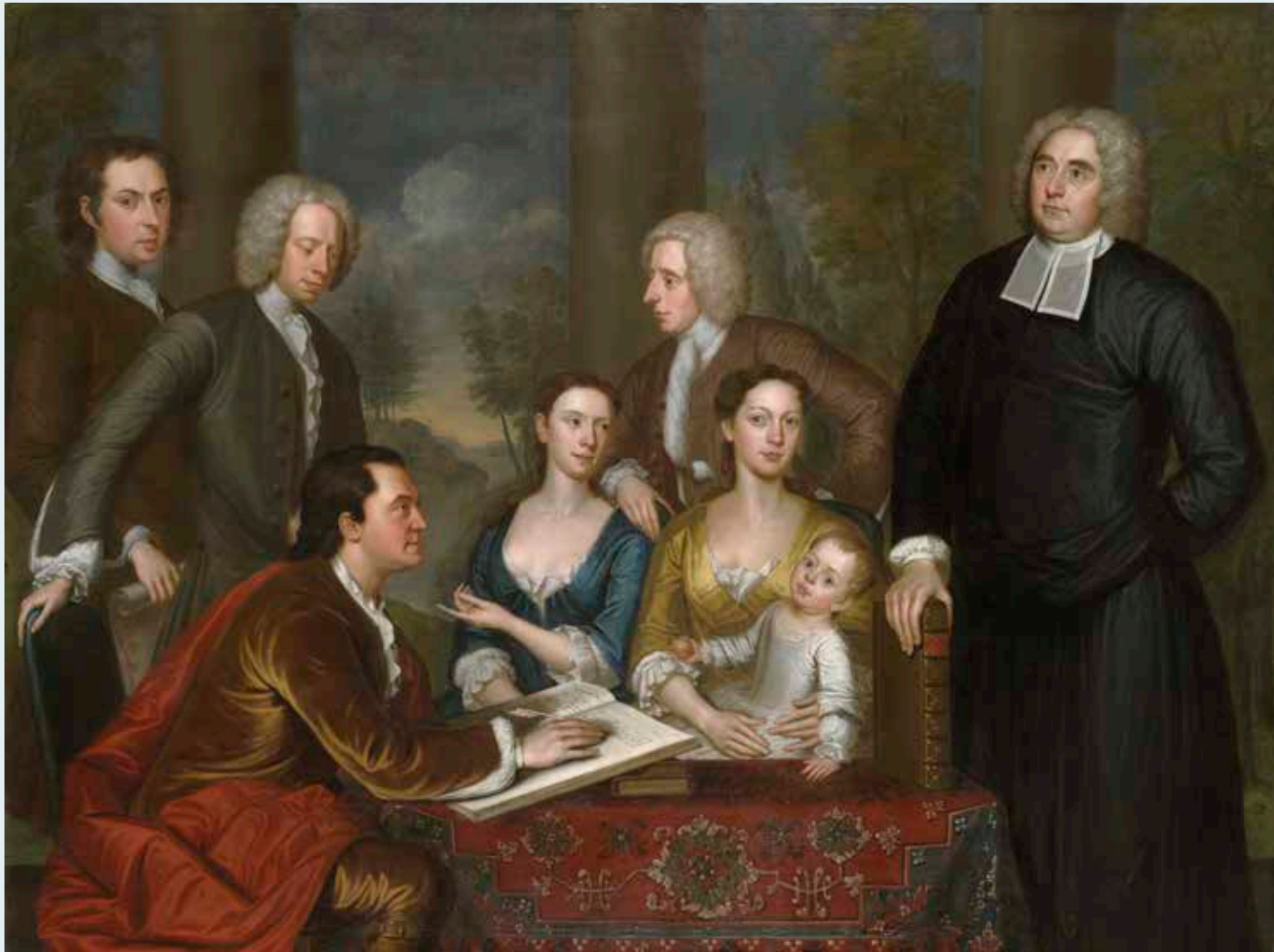
John Smibert, The Bermuda Group: Dean George Berkeley and his Family , 1729. Oil on canvas.