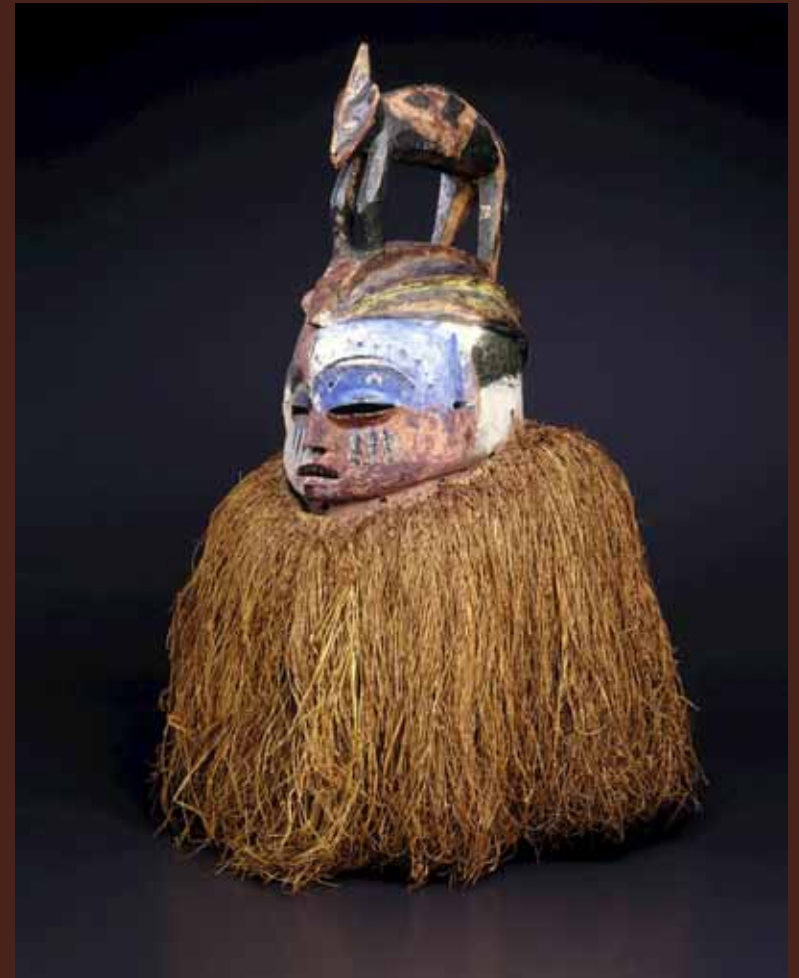
Left: Yaka peoples (Democratic Republic of Congo), Power figure (phuungu) , before 1931. Wood, metal, shells, & mixed media. Center: Salampasu peoples, Democratic Republic of Congo, Mask (kasangu) , 20 th century. Fiber, basketry, feathers. Right: Suku peoples (Democratic Republic of Congo), Helmet mask , 19 th century. Wood, pigment, raffia.