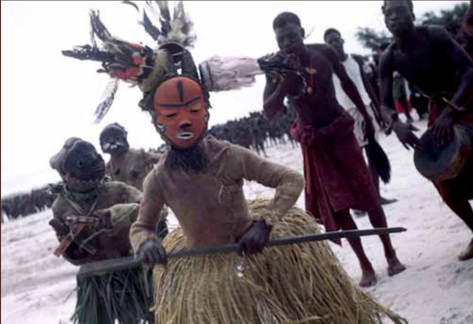
Above: Central Pende peoples (Democratic Republic of Congo), Lufushi masquerade , mid-20 th century. Wood, raffia, feathers, pigment. Right: Western Pende peoples (Democratic Republic of Congo), Mbuya mask , 20 th century. Wood, pigment, raffia.