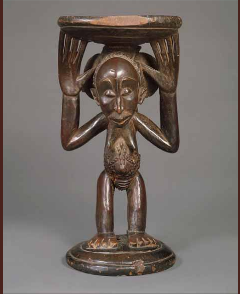
Left: Chokwe people (Angola), Chibinda Ilunga , 19 th century. Wood. Right: Buli master (Hemba artist, Democratic Republic of Congo), Chief's stool supported by a caryatid , 19 th century. Wood & mixed media.