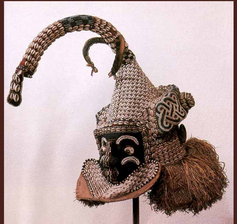
Clockwise from above: Kuba kingdom (Democratic Republic of Congo), Female mask (Ngady aMwaash) , 19 th century. Wood, pigments, beads, cowrie shells & fiber. Kuba kingdom (Democratic Republic of Congo), Royal mask (Mbwoom) , late 19 th – early 20 th century. Wood, shells, beads. Kuba kingdom (Democratic Republic of Congo), Royal Elephant mask (Mwaash aMbooy) , 20 th century. Mixed media.