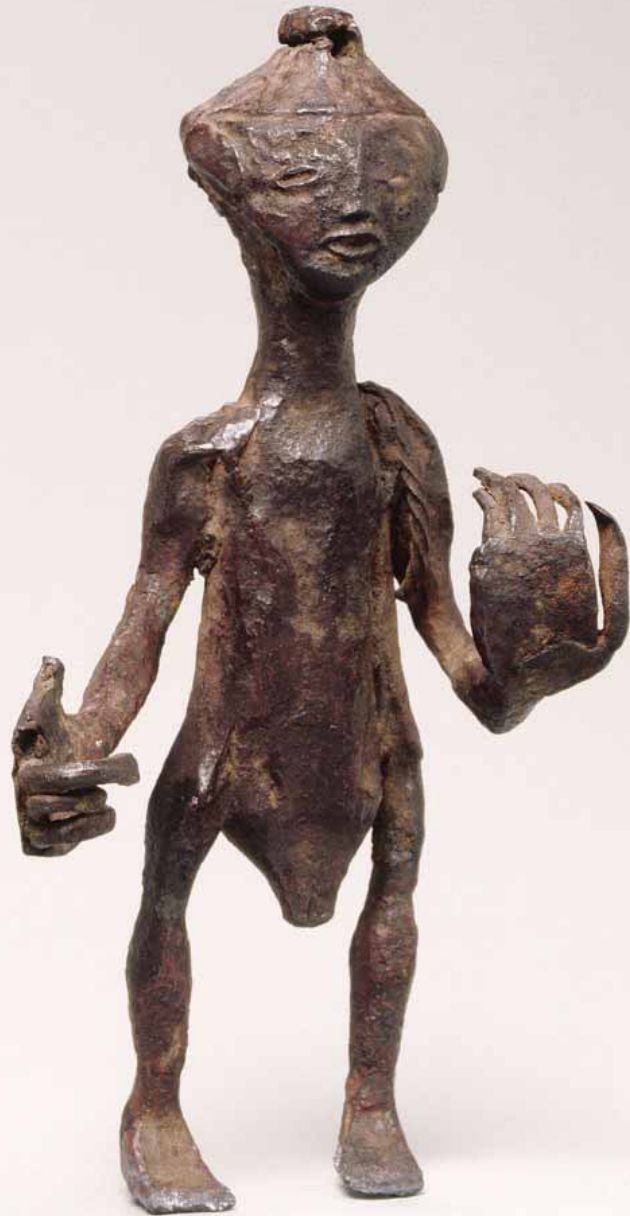
Kuba Kingdom (Democratic Republic of Congo), Wrought iron figure , 16 th century. Iron.