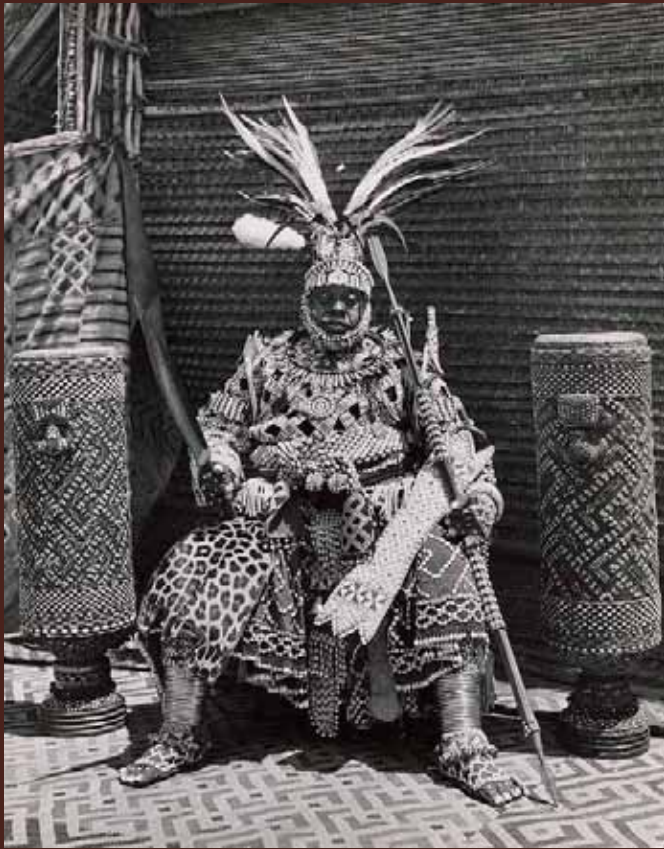
Above: Kuba Kingdom ruler (Nyim) Mbop Mabiinc maKyen (ruled 1939-1969). Right: Kuba Kingdom ruler (Nyim) Kot a MbWeekly III (ruled 1969-the present).