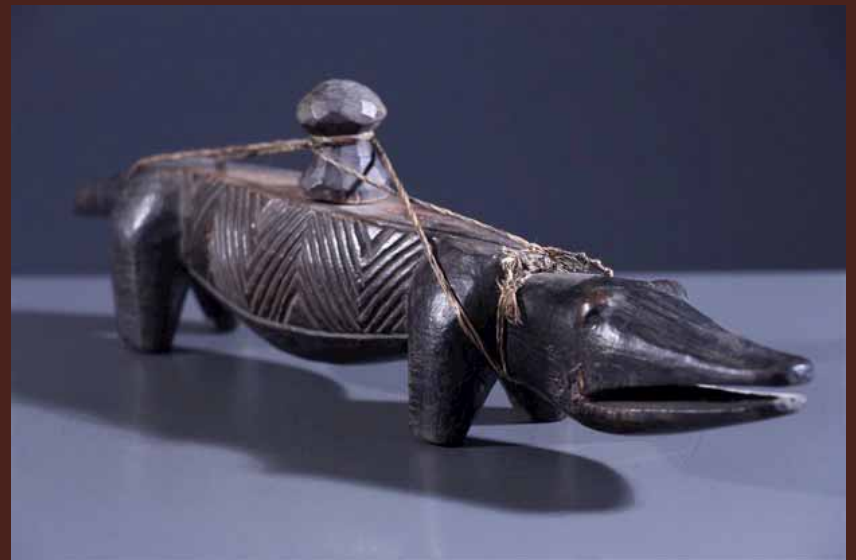
Above: Kuba kingdom (Democratic Republic of Congo), Anthropomorphic cup , 20 th century. Wood. Upper right: Kuba kingdom (Democratic Republic of Congo), Textile showing the "woot" motif, 20 th century. Raffia. Lower right: Kuba kingdom (Democratic Republic of Congo), Friction oracle (itombwa) , 20 th century. Wood, fiber.