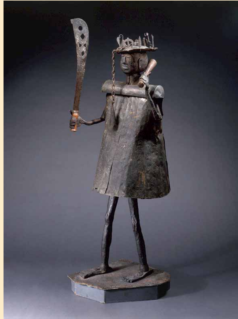
Left: Fon peoples (Ganhu Huntondji), Republic of Benin, Warrior Figure , ca. 1858-89. Wood & iron. Right: Fon peoples (Akati Akpele Kendo), Republic of Benin, Warrior Figure , ca. 1858-89. Iron.