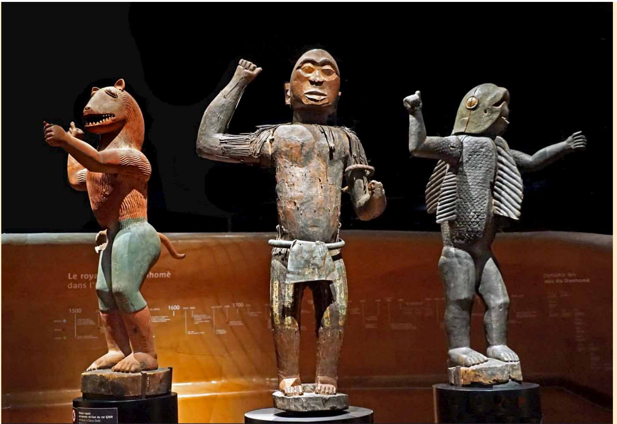
Left: Fon peoples (Sosa Adede), Republic of Benin, Man-shark dedicated to King Gbehanzin , 1889-94. Polychrome wood. Center: Fon [peoples (Sosa Adede), Republic of Benin, King Guezo , 19 th century. Polychrome wood. Right: Fon peoples (Sosa Adede), Republic of Benin, King Glele in the guise of a Lion , ca. 1858-89. Polychrome wood.