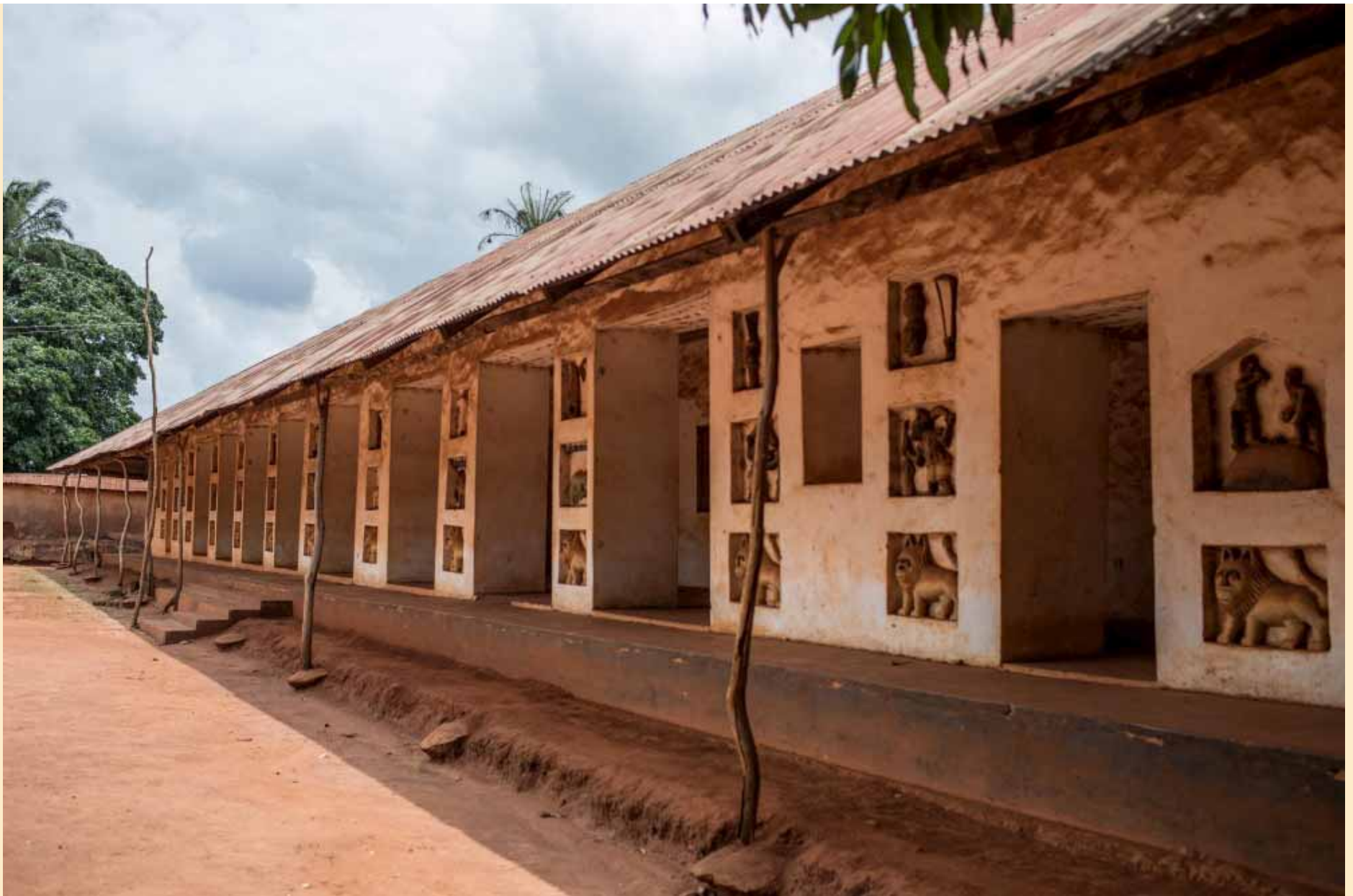
Above: Fon peoples (Cyprien Tokundagba), Republic of Benin, Adjalala building, King Guezo's palace , 20 th century. Polychrome adobe.