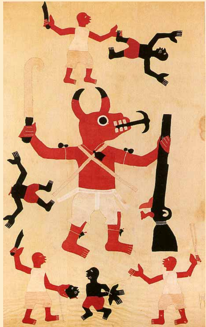
Left & right: Fon peoples (Yemadje workshop), Republic of Benin, Applique banners , 20 th century. Cotton.