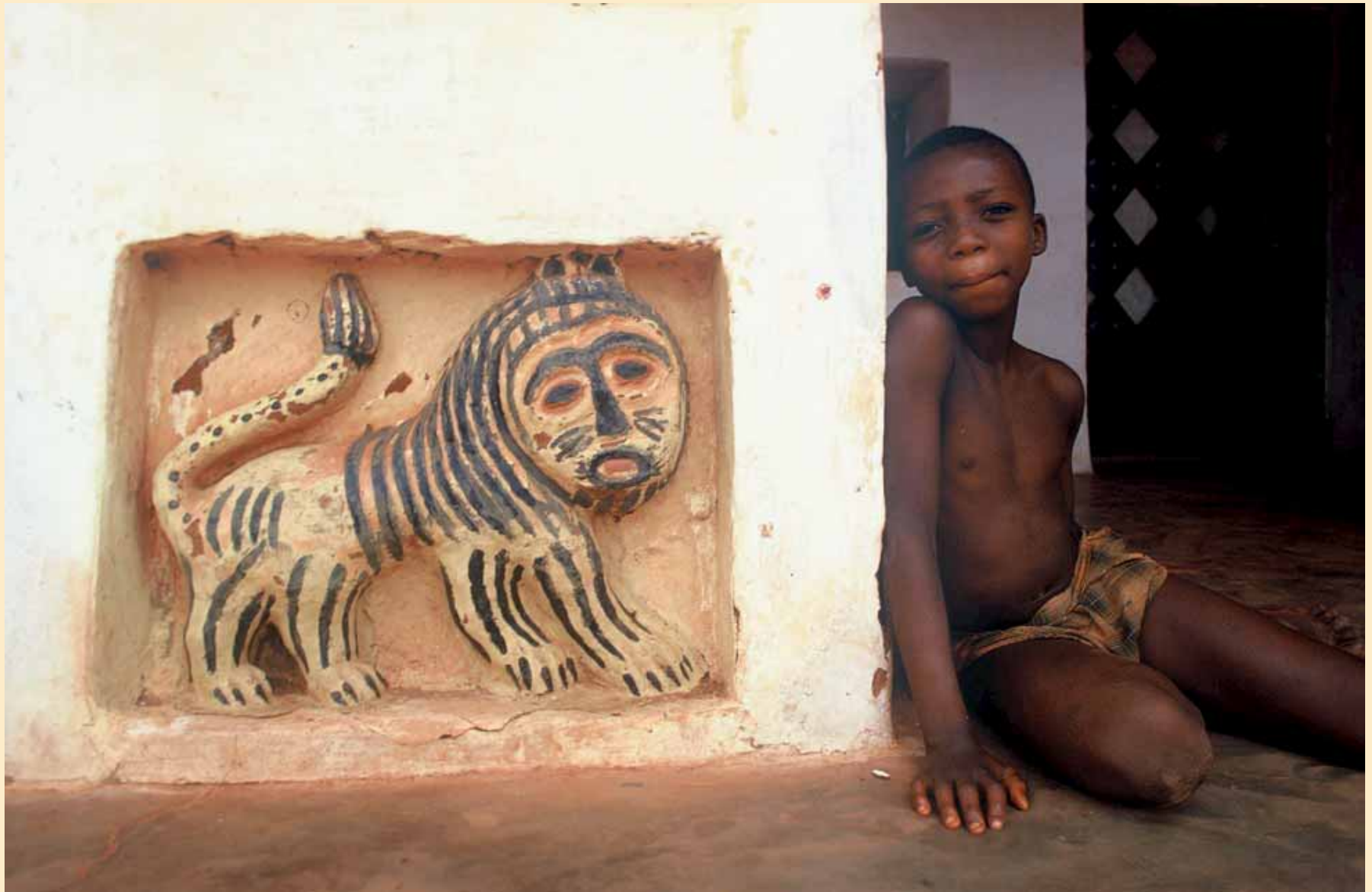
Above: Fon peoples (Cyprien Tokundagba), Republic of Benin, Detail of bas-relief from the Adjalala building, King Guezo's palace, 20 th century. Polychrome adobe.