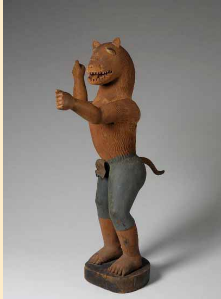
Left: Fon peoples (Sosa Adede), Republic of Benin, Man-shark dedicated to King Gbehanzin , 1889-94. Polychrome wood. Right: Fon peoples (Sosa Adede), Republic of Benin, King Glele in the guise of a Lion , ca. 1858-89. Polychrome wood.