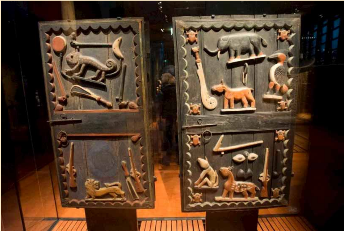
Above & right: Fon peoples (Sosa Adede), Republic of Benin, Royal doors from King Glele's palace and tomb, 1860. Painted wood.