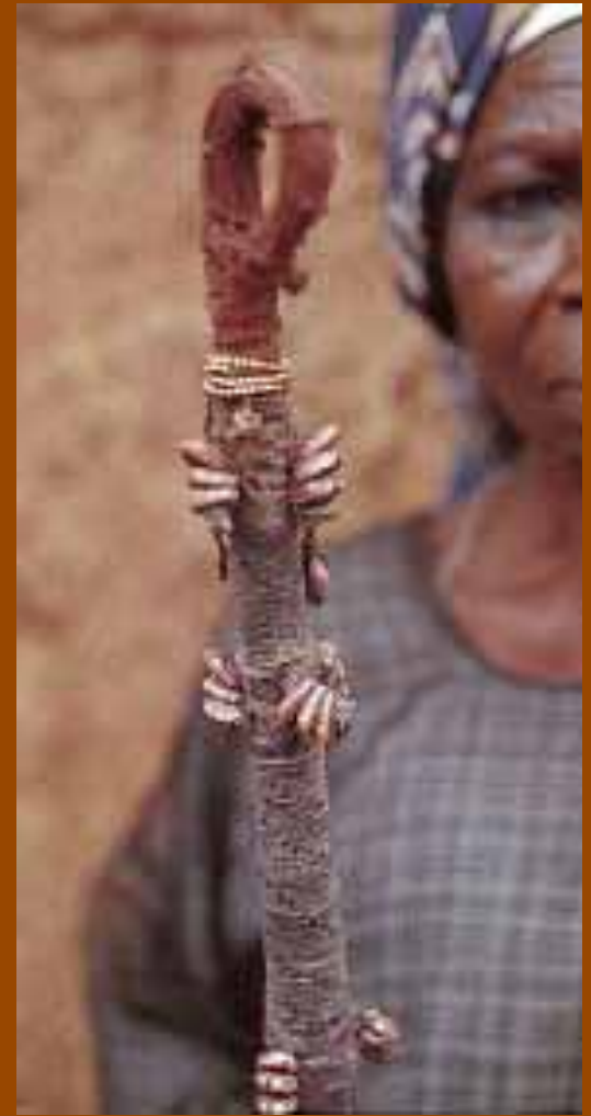
Left: Yoruba peoples (Nigeria), Shrine sculpture for Sopona , 20 th century. Wood, beads, shells, straw, hair, monkey skull. Center: Fon peoples (Republic of Benin), Shrine for Sakpata, Abomey , 20 th century. Right: Devotee of Nana Bukuu holding her dance wand (ileesin), Republic of Benin, 1960s. Straw, beads, leather, chicken feet.