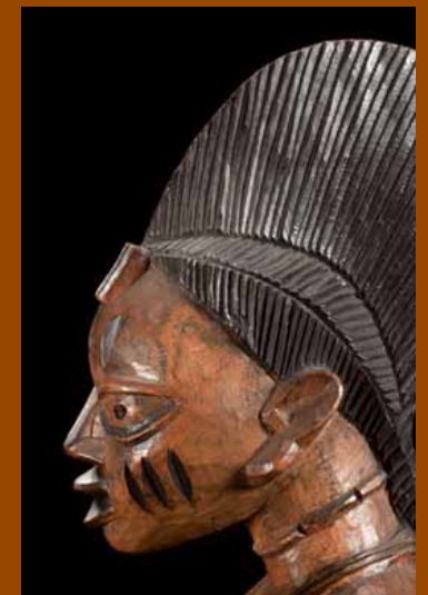
Clockwise from above: Yoruba peoples (Nigeria), Deji of Akure wearing beaded crown, robe & sandals, circa 1960s . Yoruba peoples, Nigeria, Staff for Shango (Oshe Shango), 20 th century . Wood. Yoruba culture, Nigeria, detail of an Ibeji (twin) figure, showing abaja markings, 20 th century . Painted wood.