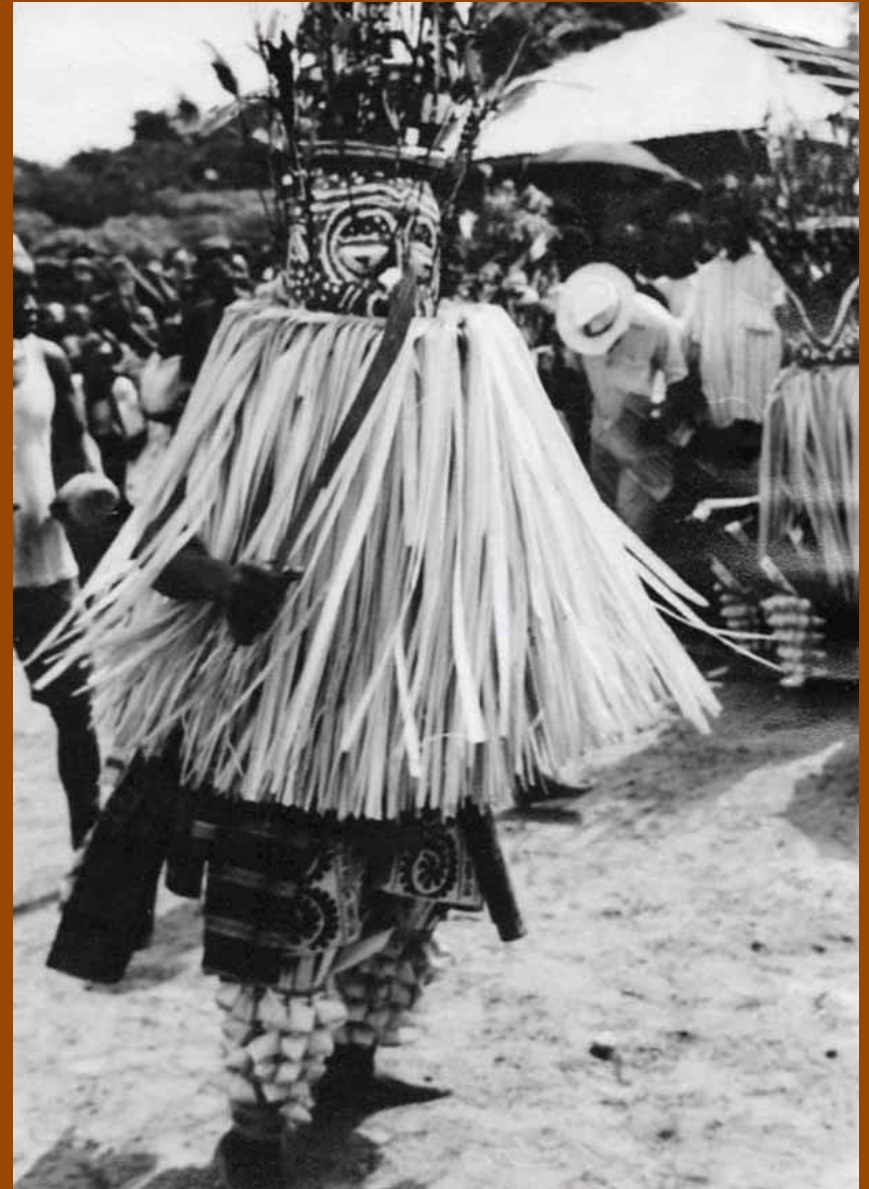
Left: Yoruba peoples (Nigeria) Epa headdress, 20 th century. Wood, pigment. Right: Yoruba peoples (Nigeria), Epa masquerader, Ekiti, Nigeria, 20 th century.