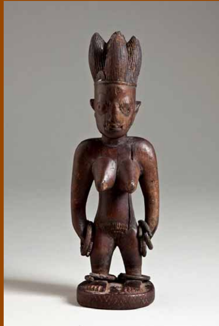
Left: Yoruba peoples, Shango Shrine Figure holding a dance staff (Oshe shango), 19 th century. Wood & beads. Above: Yoruba culture, Nigeria, Ibeji (twin) figure, 20 th century. Wood with iron bracelets.