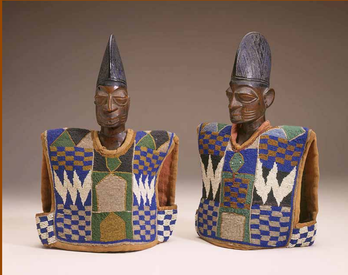
Yoruba culture, Nigeria, Ibeji (twin) figures, 20 th century. Wood, pigment, beaded jackets.