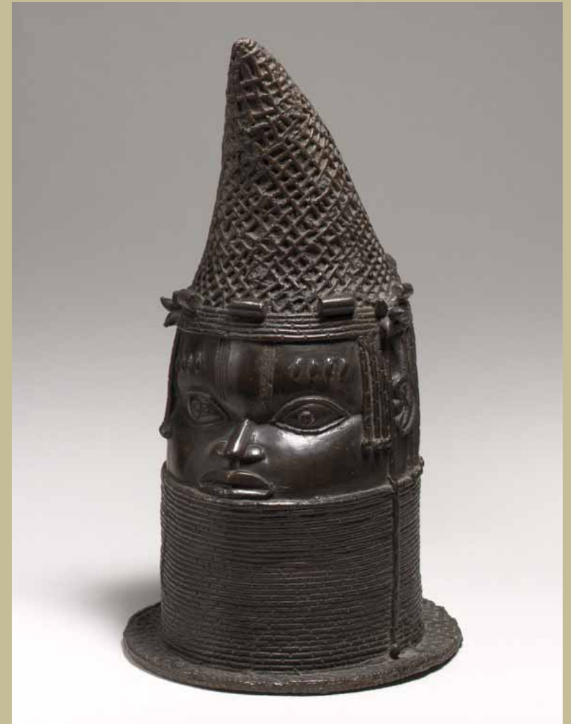
Left: Benin Kingdom, Nigeria, Queen Mother head with “iyoba” (chicken’s beak) crown, 16th century. Brass. Right: Benin Kingdom, Nigeria, Queen Mother head with “iyoba” (chicken’s beak) crown, 18th century. Brass.