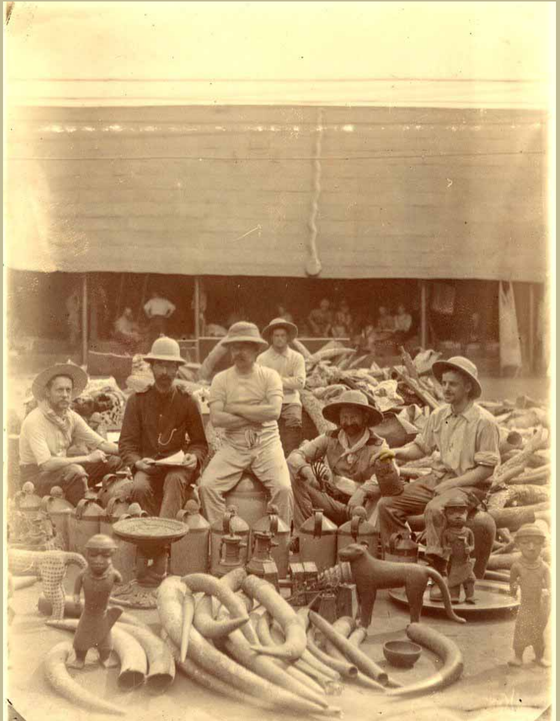
Photograph of soldiers sitting among the Oba's royal artifacts following the British Punitive Expedition, Benin City, Nigeria, 1897.