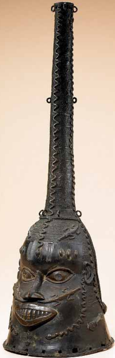
Benin Kingdom, Nigeria, Helmet mask (ododua), 18th century. Brass.