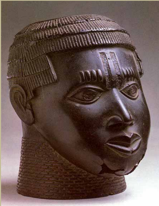
Above left: Benin Kingdom, Nigeria, Memorial head, late 15th century. Brass.