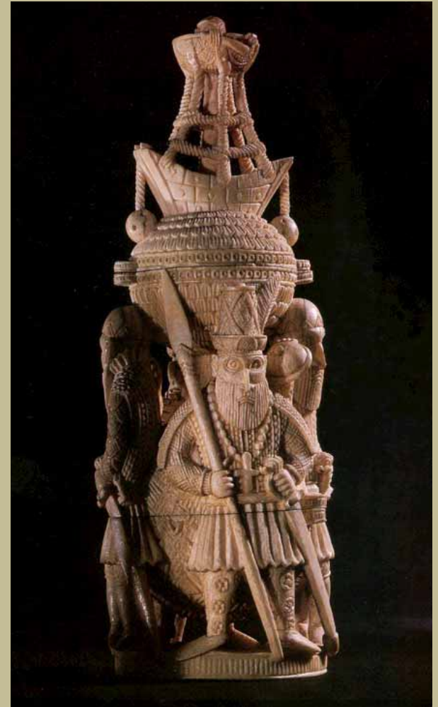
Left: Benin Kingdom, Nigeria, Hip mask of Idia, Queen Mother of King Esigie, 16th century. Ivory. Above: Benin Kingdom, Nigeria, Salt cellar featuring Portuguese soldiers, 16th century. Ivory.