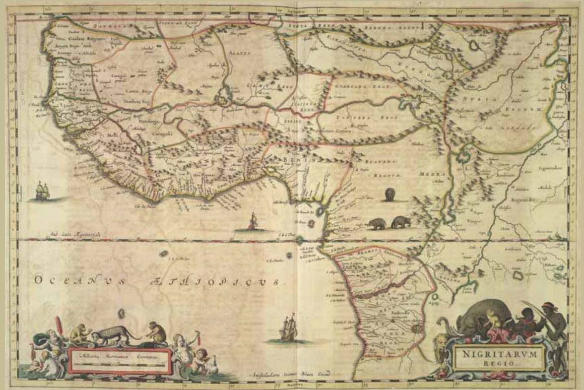
Right: Map detail of the Benin Kingdom, 17th century.