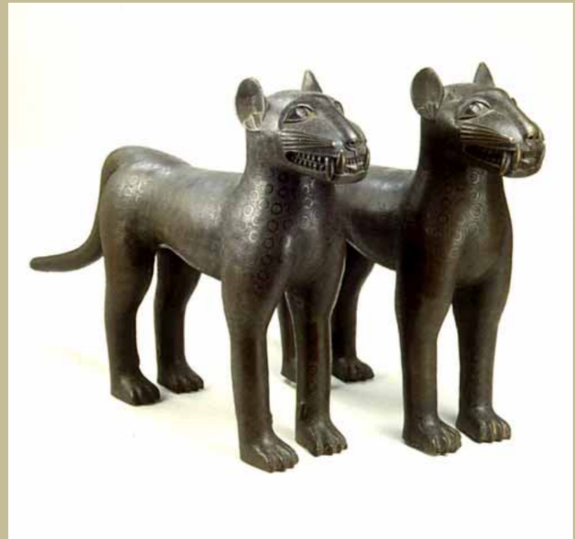
Left: Benin Kingdom, Nigeria, Figure with mudfish head, 17th century. Brass. Right: Benin Kingdom, Nigeria, A pair of water vessels in the form of leopards, 16th century. Bronze.