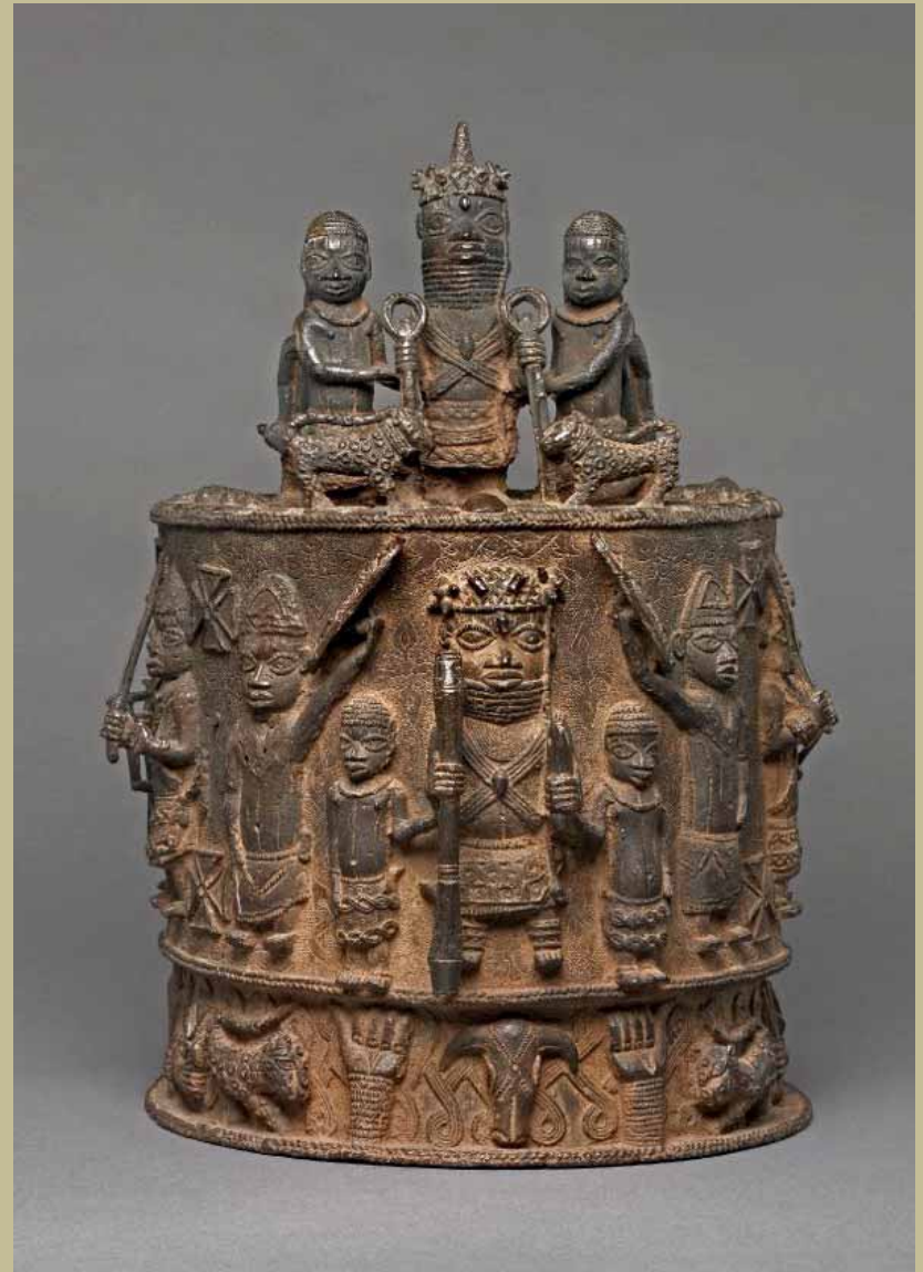
Benin Kingdom, Nigeria, Altar to the hand (ikegobo), 18th century. Brass.