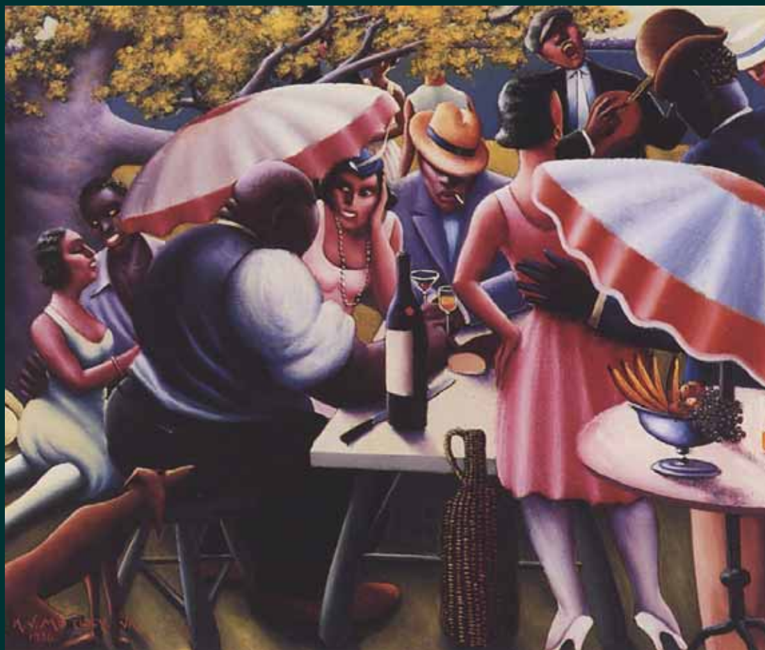
Archibald J. Motley, Jr., The Picnic , 1936. Oil on canvas.