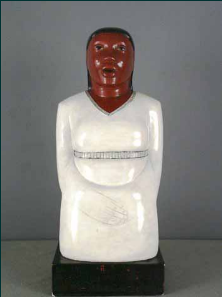
Sargent Johnson, Negro Woman , 1933. Terracotta.