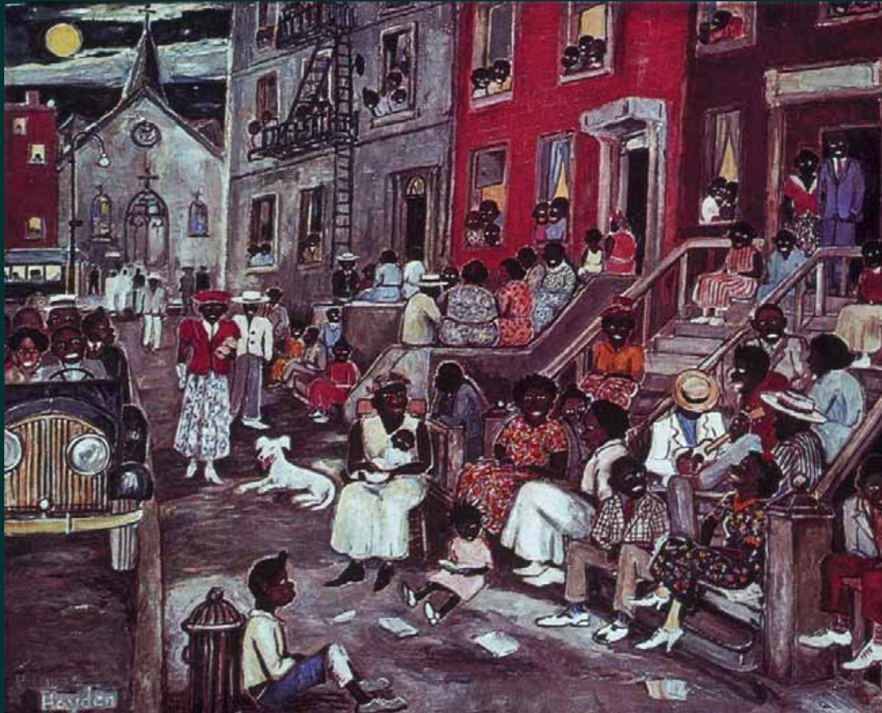
Palmer Hayden, Midsummer Night in Harlem , 1936. Oil on canvas.