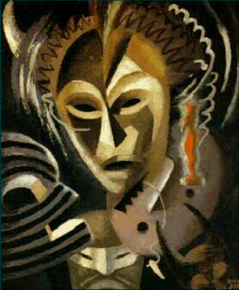
Lois Mailou Jones, Les Fétiches , 1938. Oil on canvas.