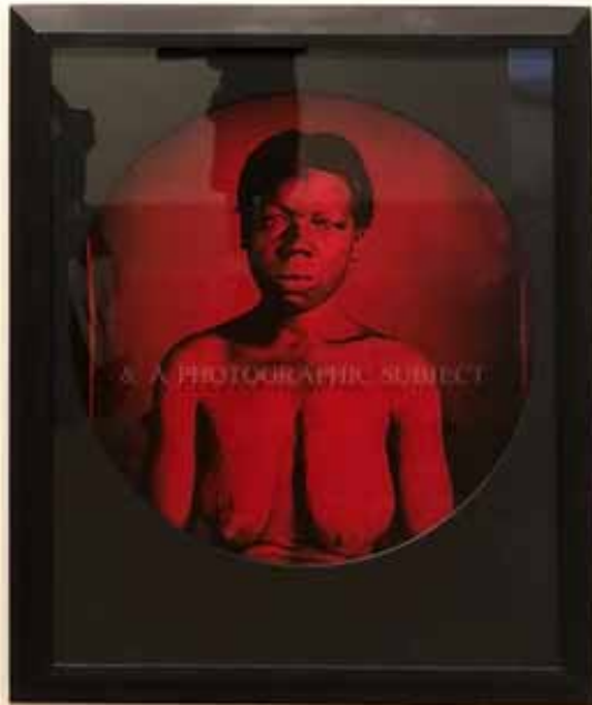
Carrie Mae Weems, A Negroid Type/You Became a Scientific Profile/An Anthropological Debate/& A Photographic Subject , 1995-96. Chromogenic color prints with sandblasted text on glass.