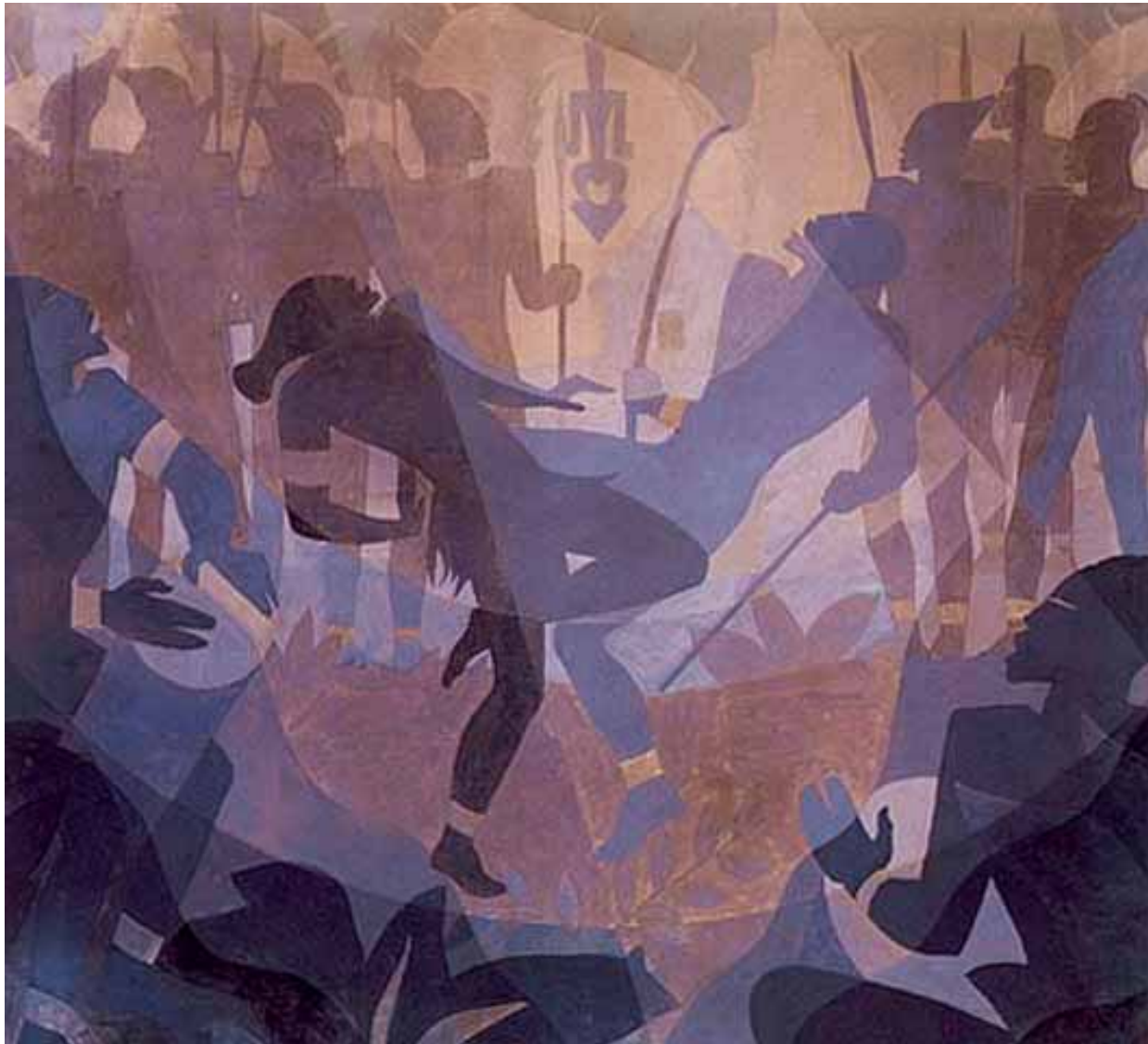
Aaron Douglas, Aspects of Negro Life: The Negro in an African Setting , 1934. Oil on canvas.