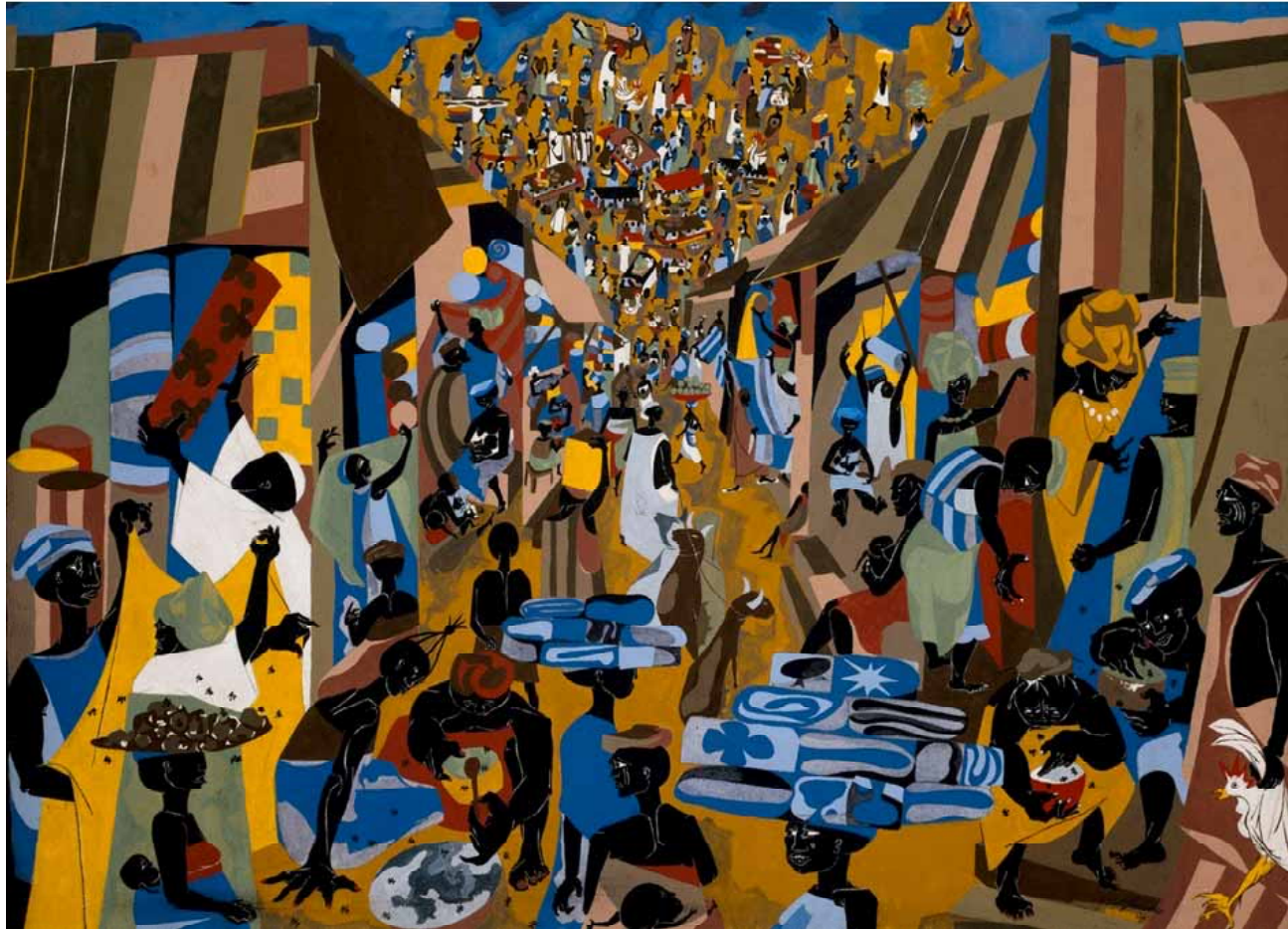
Jacob Lawrence, Street to Mbari , 1964. Tempera, gouache and graphite on paper.