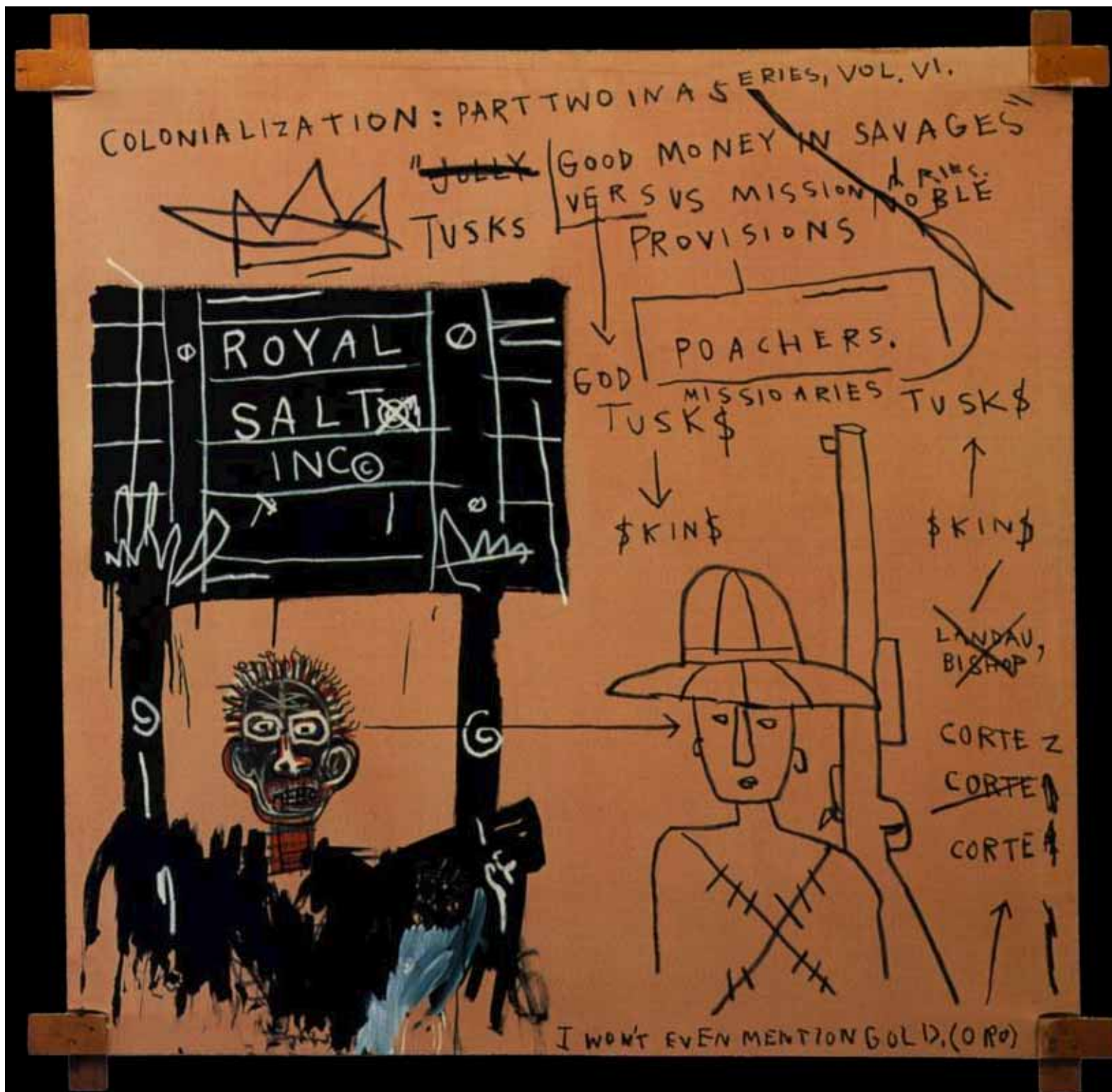
Jean-Michel Basquiat, Native Carrying Some Guns, Bibles, Amorites on Safari , 1982. Acrylic and oil on paper, mounted on canvas, and exposed wood.