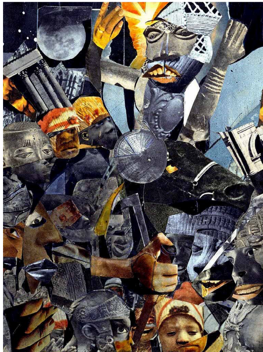
Romare Bearden, Sermons The Walls of Jericho , 1964. Collage with paint, ink, & graphite on cardboard.