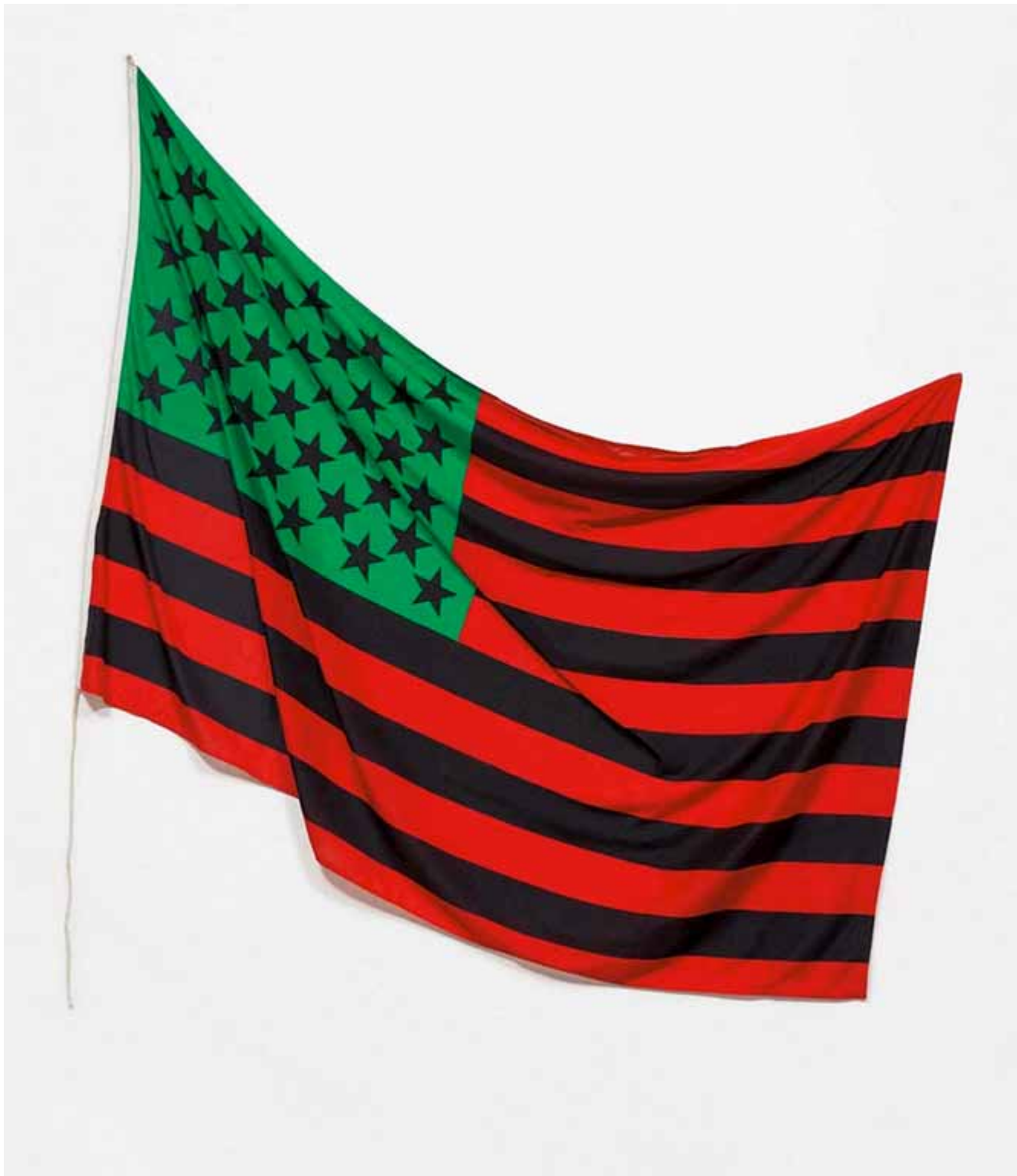
David Hammons, African-American Flag , 1990. Dyed cotton.