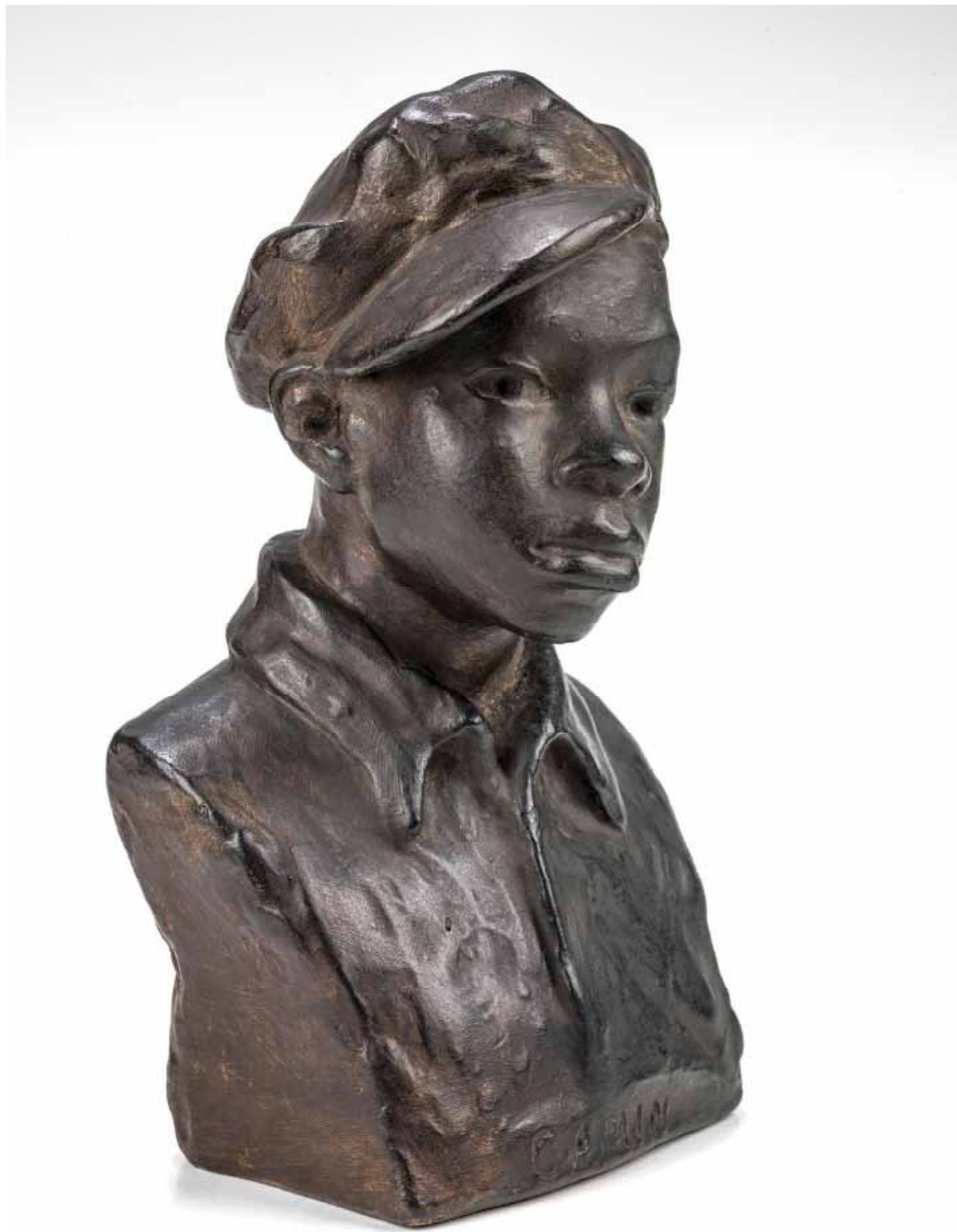
Augusta Savage, Gamin , 1930. Bronze.