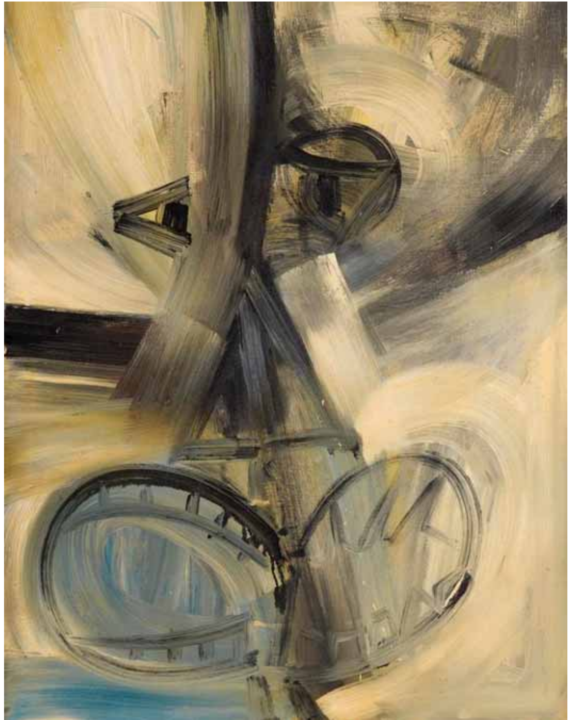
Merton Simpson, Confrontation #23 , 1969-71. Oil on canvas.