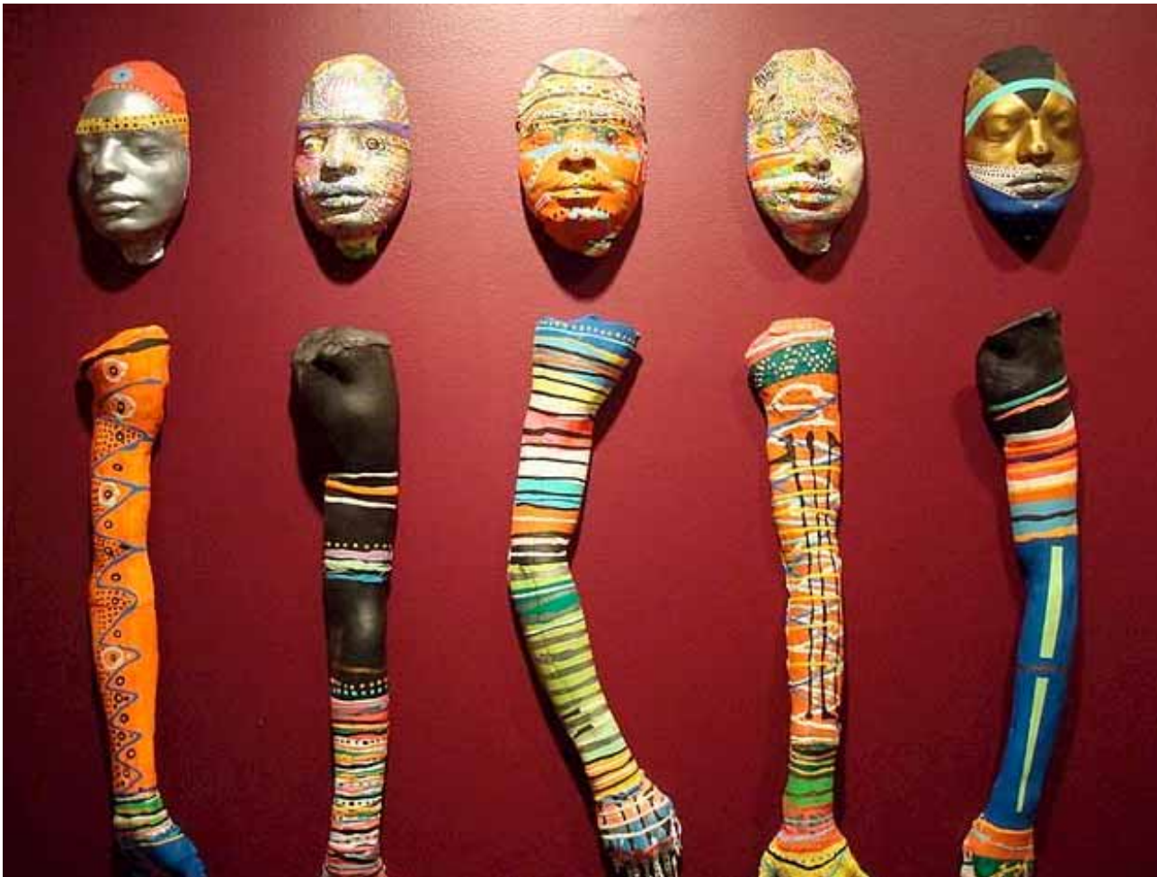
Ben Jones, Black Face and Arm Unit (detail) , 1971. Acrylic on plaster.