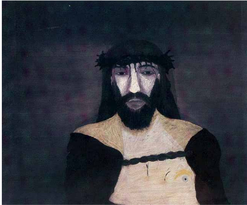
Horace Pippin, Christ Crowned with Thorns , 1938. Oil on canvas.