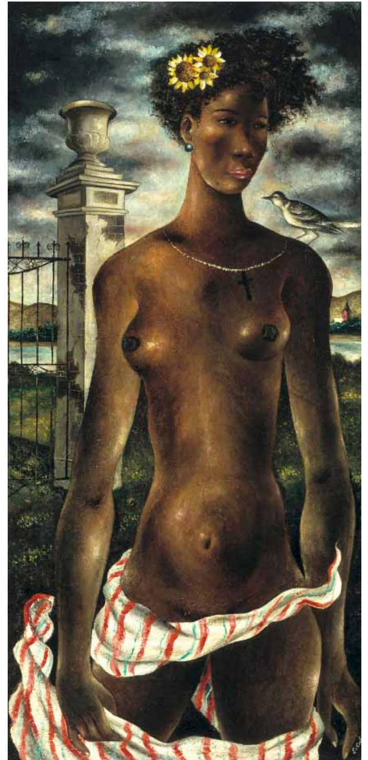
Eldzier Cortor, Southern Gate , 1942-43. Oil on canvas.