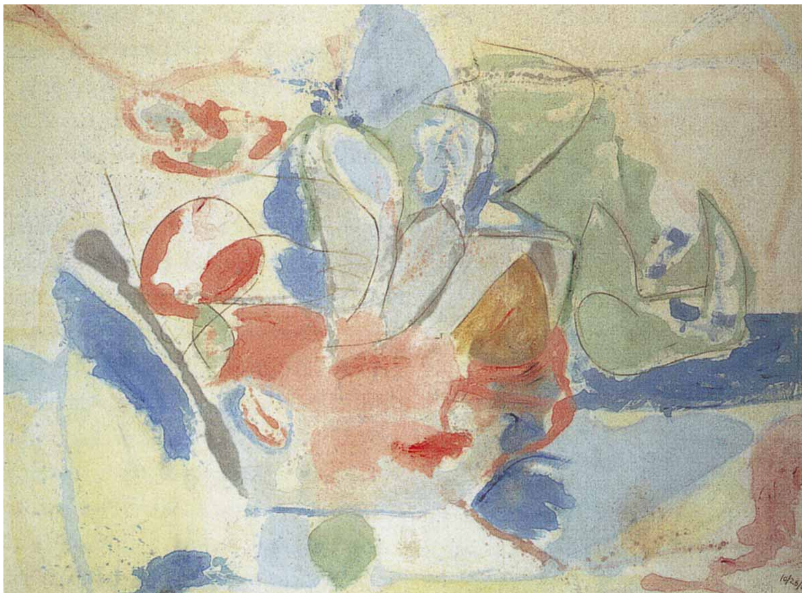
Helen Frankenthaler, Mountains and Sea , 1952. Oil on canvas.