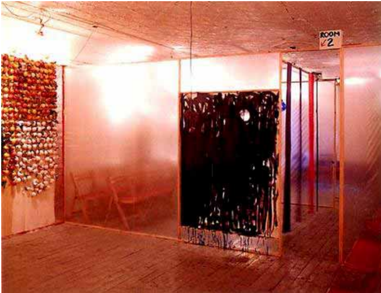
Allan Kaprow, 18 Happenings in 6 Parts , 1959. New York.