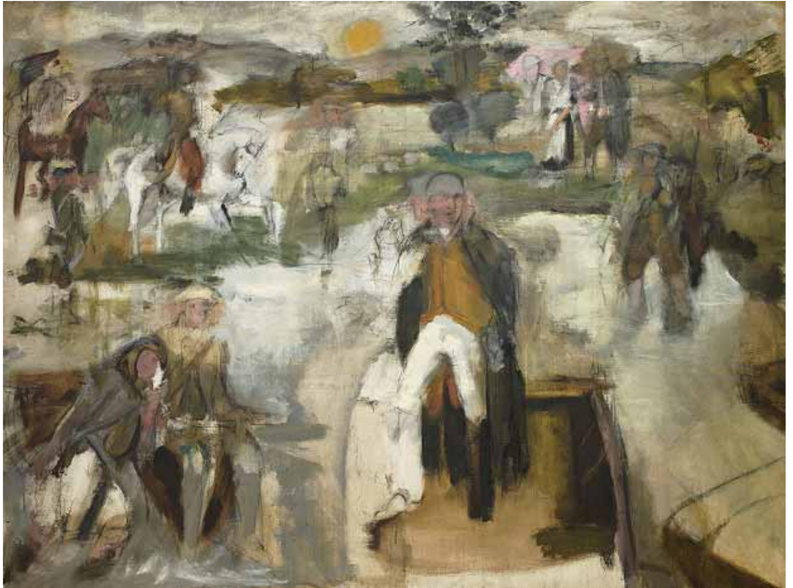
Larry Rivers, Washington Crossing the Delaware , 1953. Oil, graphite and charcoal on linen.