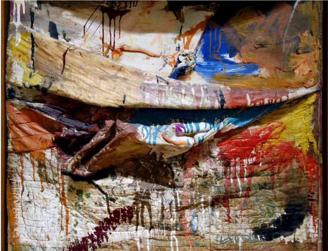
Above detail and right: Robert Rauschenberg, Bed , 1955. Oil and pencil on pillow, quilt, and sheet on wood supports.