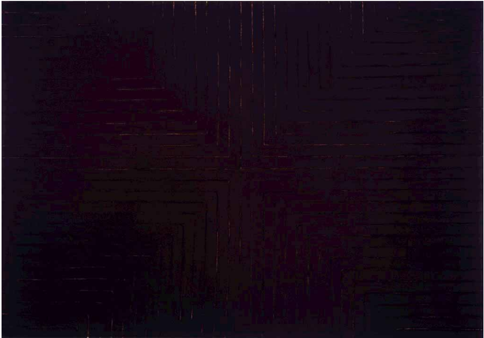
Frank Stella, Arbeit Macht Frei , 1958. Enamel on canvas.