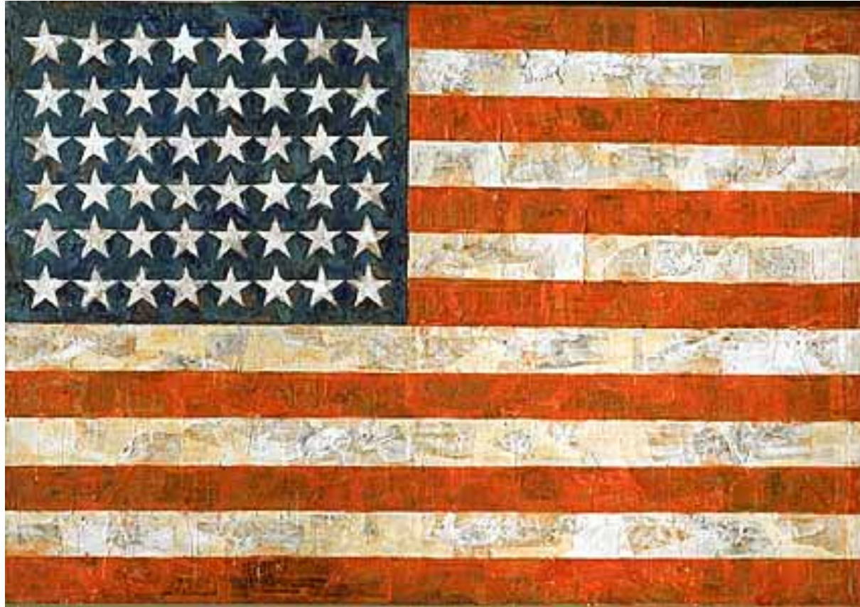
Jasper Johns, Flag , 1954-55. Encaustic, oil and collage on fabric mounted on plywood.