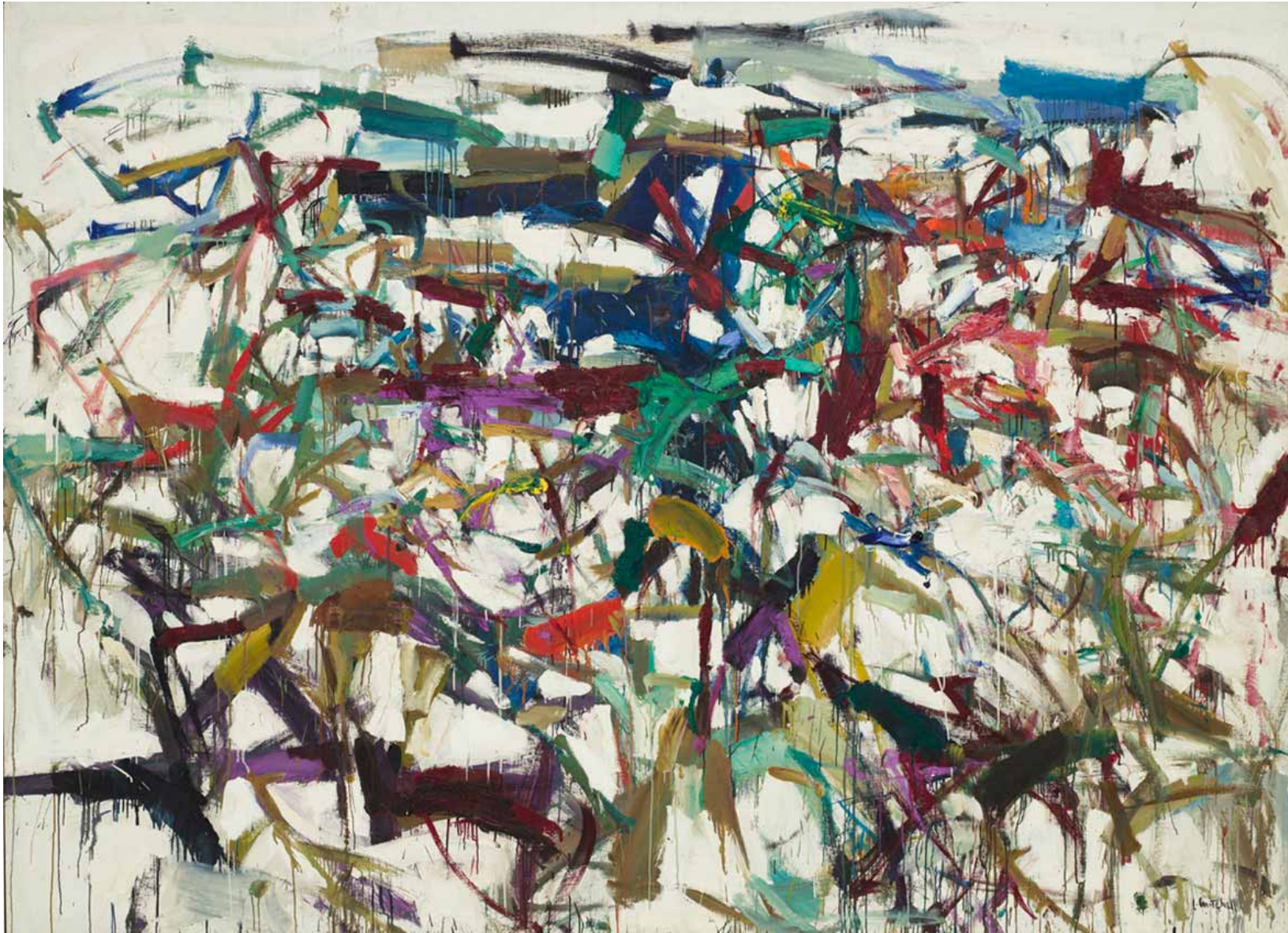
Joan Mitchell, Ladybug , 1957. Oil on canvas.