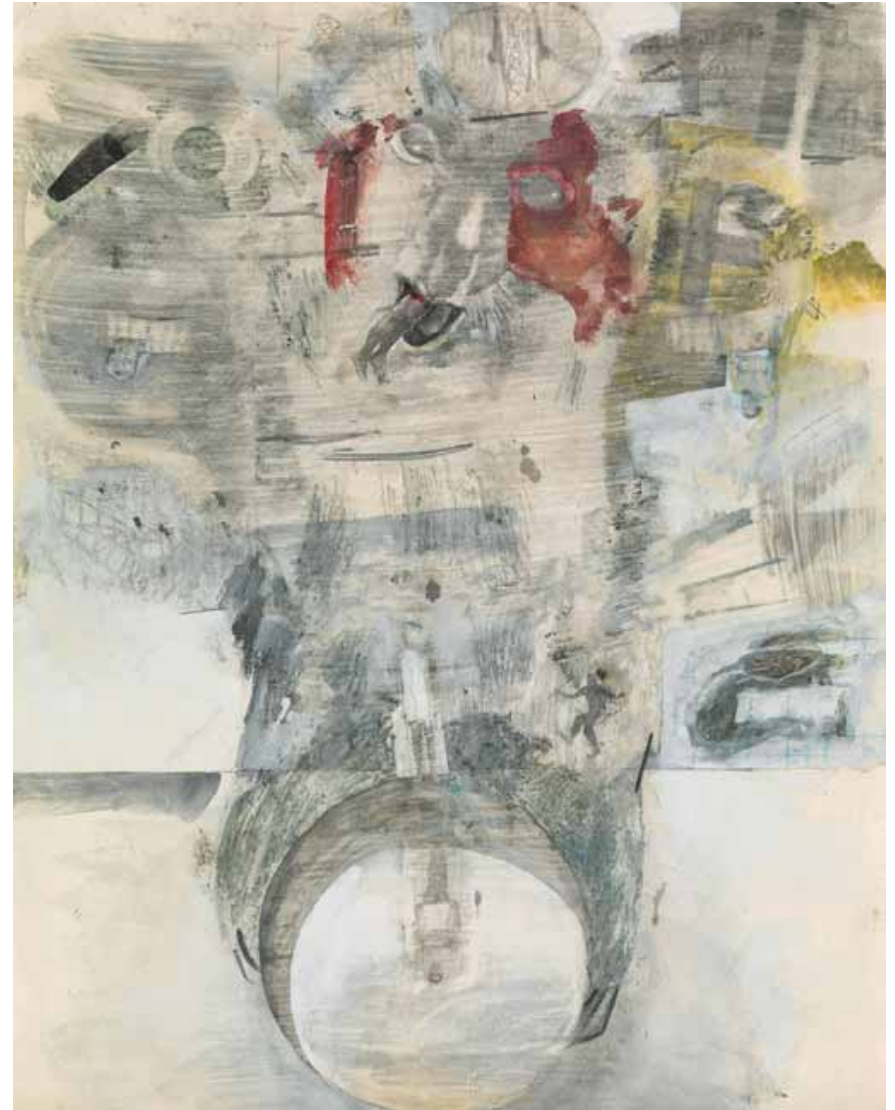
Left: Robert Rauschenberg, Erased De Kooning Drawing , 1953. Traces of ink and crayon on paper with mat and frame. Right: Robert Rauschenberg, Canto XXXIV (XXXIV Drawings for Dante's 'Inferno') , 1959-60. Solvent transfer, pencil, watercolor, and gouache on paper.