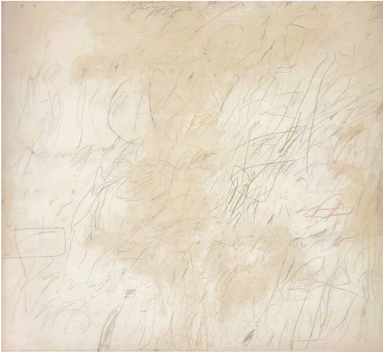
Cy Twombly, Arcadia , 1958. Oil-based house paint, wax crayon, colored pencil, and lead pencil on canvas.