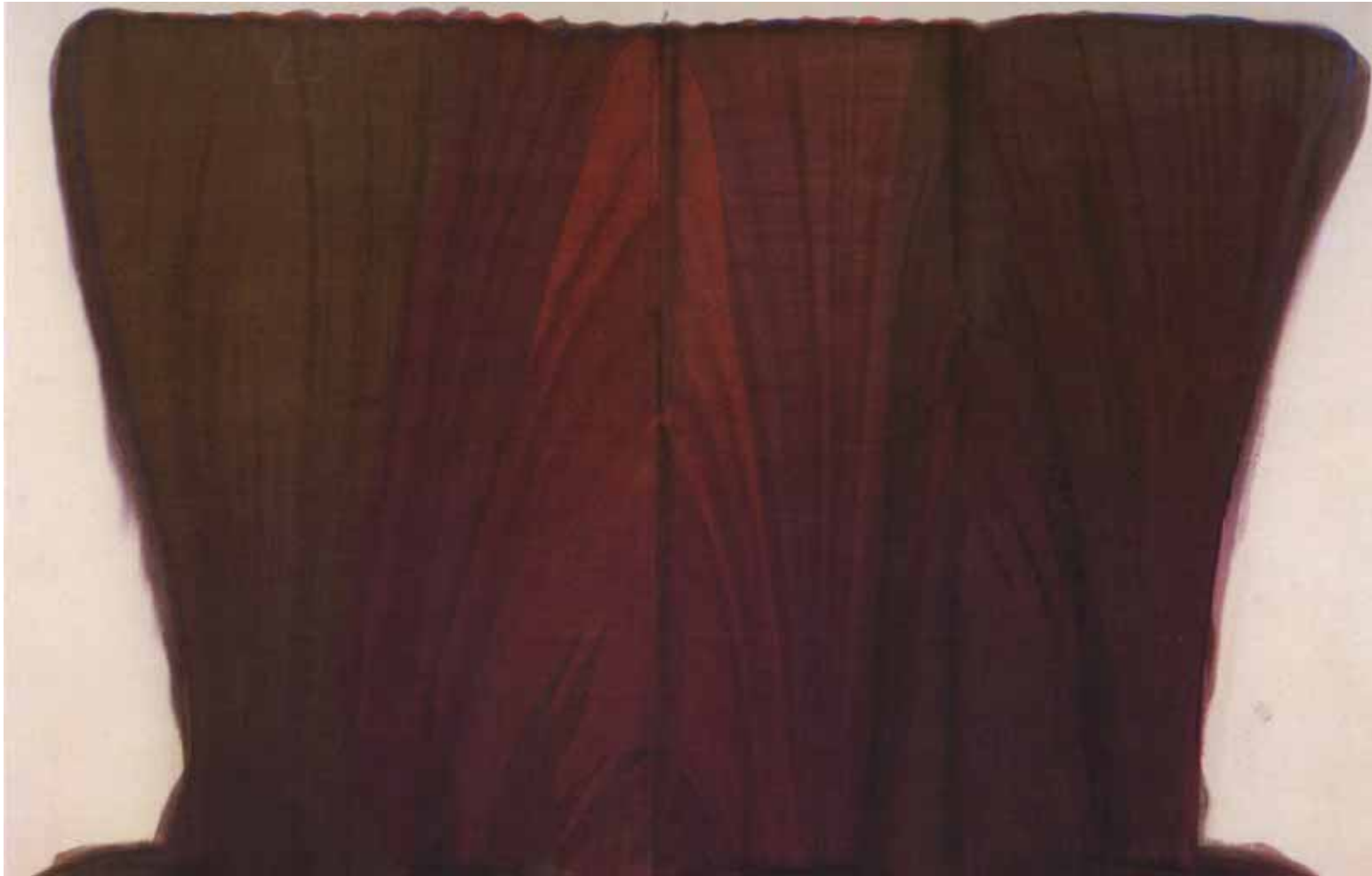
Morris Louis, Beth Heh , 1958. Acrylic on canvas.