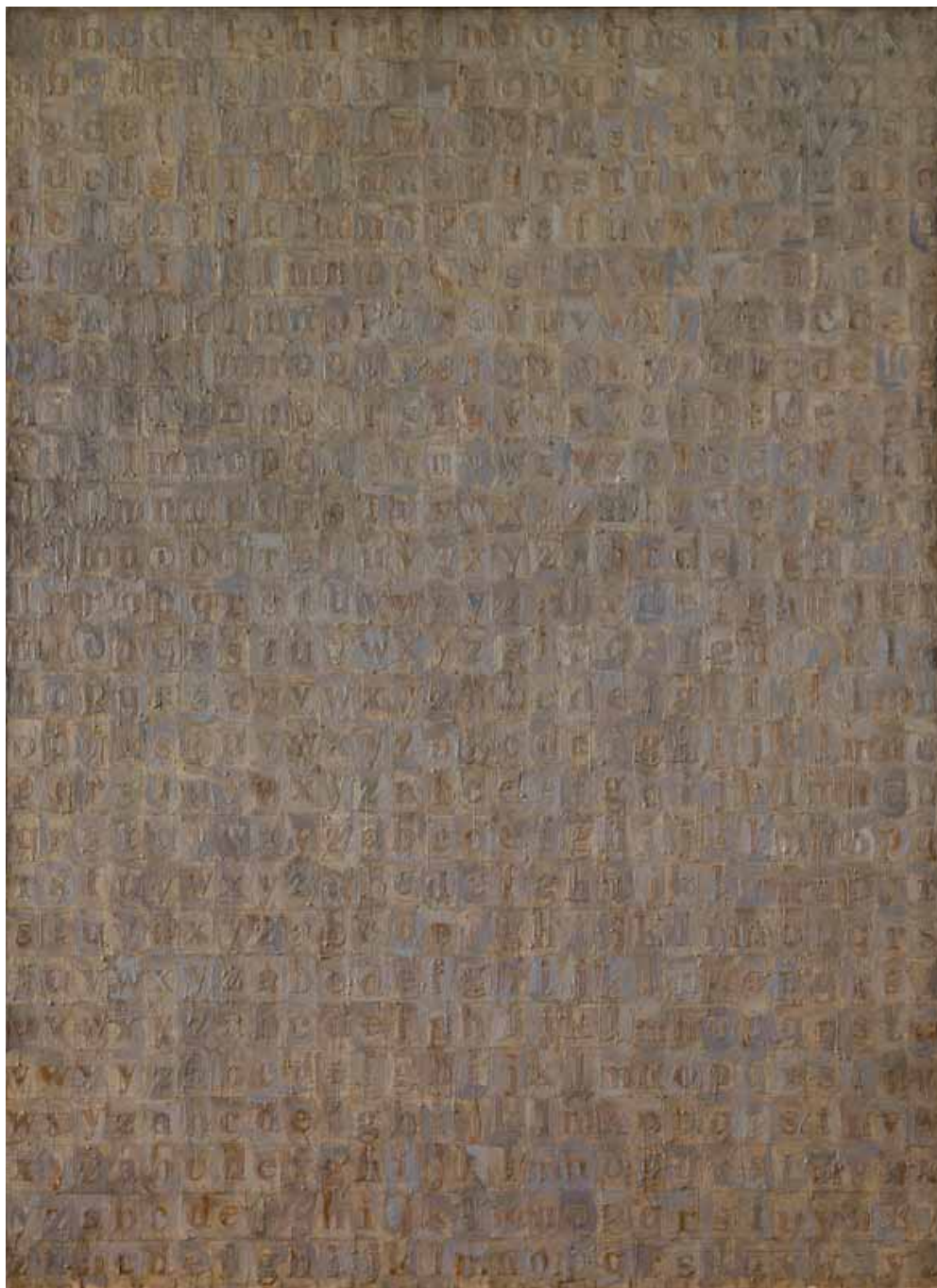
Jasper Johns, Gray Alphabet , 1956. Encaustic and collage on canvas.