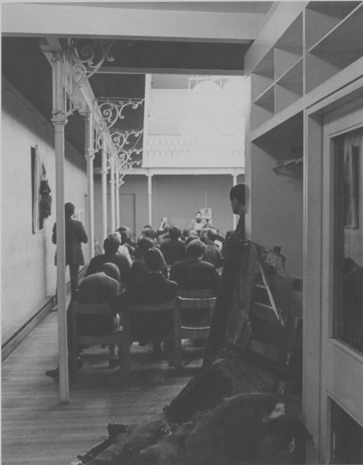
Africa Centre, 1966, London, venue of DIAS