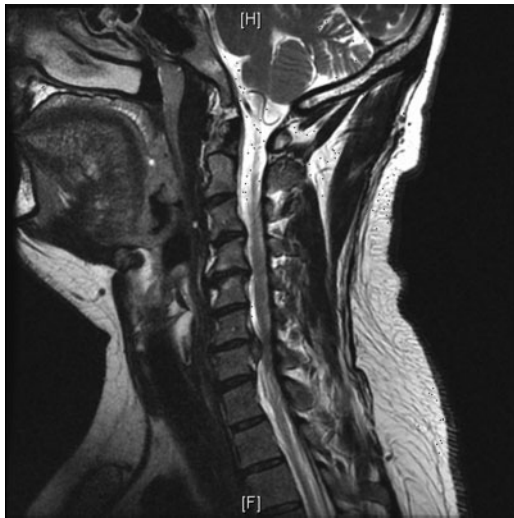
Figure 2 Sagittal magnetic resonance imaging scan of the cervical spine. The image displays disruption at the C6 segment. There is also osteophyte lipping at the margins of the vertebral bodies above the C6 level.

symptoms in the non-dominant arm, being under 54 years of age, and that looking down did not worsen the symptoms. These findings fit the clinical prediction rule that was proposed by Cleland et al. 18 that identified patients who were most likely to achieve success with physical therapy interventions.