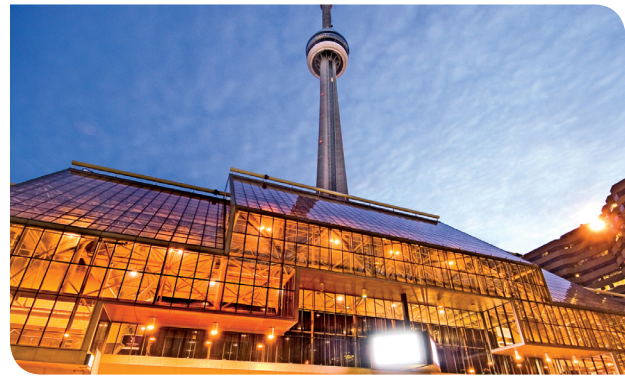
Metro Toronto Convention Centre