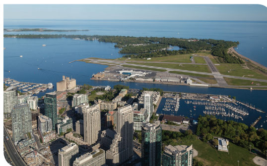
A view towards Toronto Island Airport (Billy Bishop)

For travelers coming from outside Canada, you may want to contact your mobile phone provider in advance to learn about Canadian call fees and to determine whether money-saving international travel phone call fee packages for Canada are available.