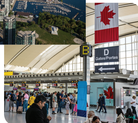
Pearson International Airport