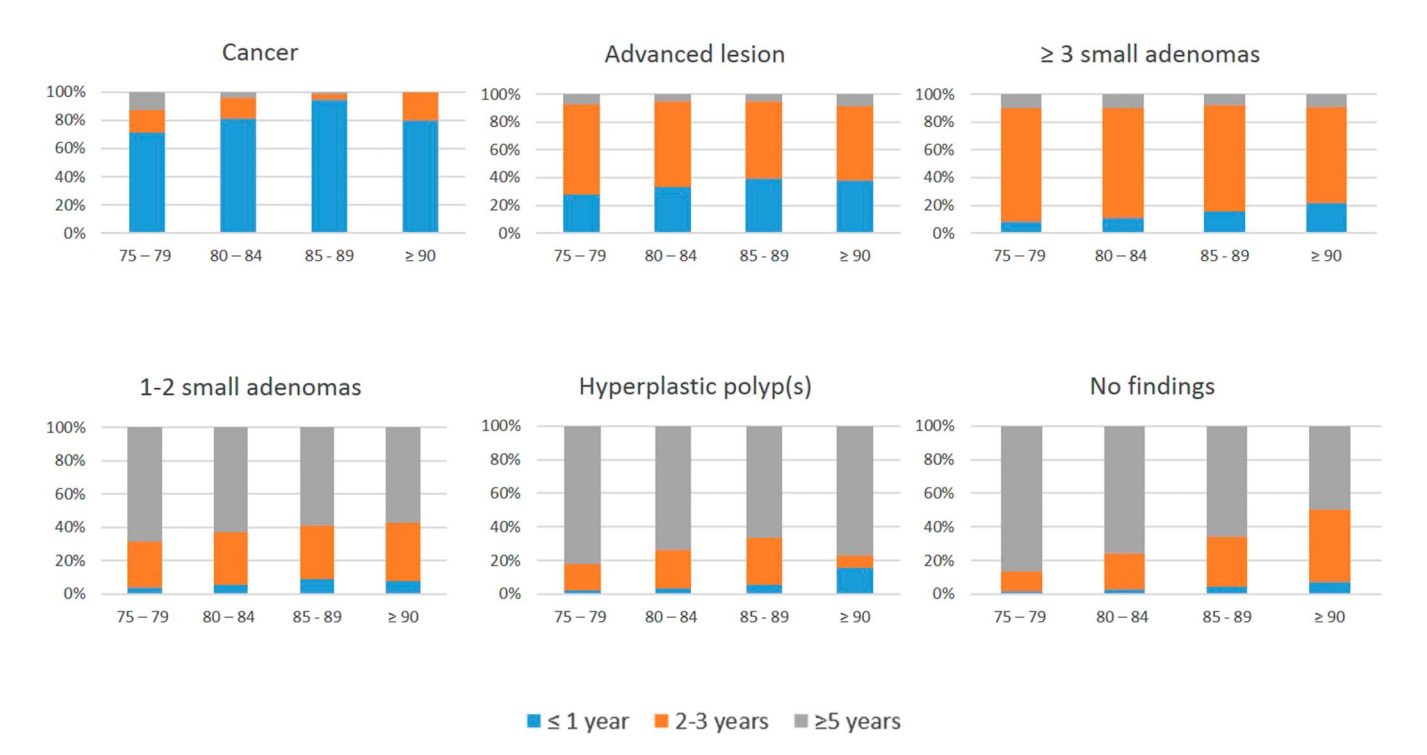
Figure 3. Among those attending surveillance colonoscopy who were told to return for future colonoscopy, the follow-up intervals provided by age and most recent surveillance finding.

The strengths of our study include the use of a large, national registry that uses discrete fields for indication and findings and includes many practices throughout the country which is likely broadly representative of US practice. Because of the registry's large size, we had the power to study CRC as an outcome and were also able to evaluate advanced lesions with even greater precision. The large number of colonoscopy examinations also enables evaluation of adults aged \geq 75 years, for which there is little existing literature. Finally, one of our key primary outcomes (i.e., postprocedure surveillance recommendation) was a required data field and our results appear to make intuitive sense. For example, our analysis of recommendations for stopping colonoscopy and also intervals when follow-up is recommended seem internally consistent and valid. Older adults and those with less advanced findings are less